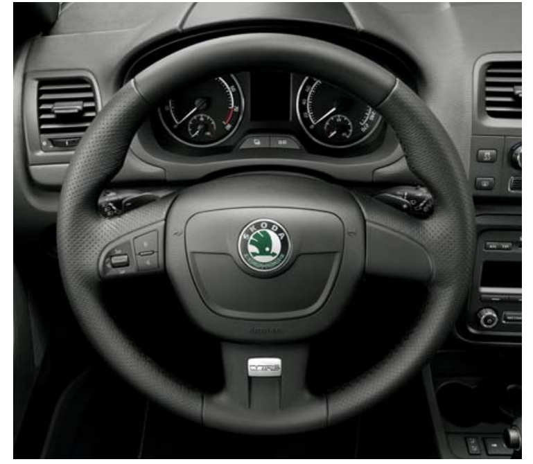
The 3-spoke sports leather steering wheel enhances the dynamic riding experience. The car may also come equipped with the multifunctional leather steering wheel (see photo), which enables you to control the radio, phone and shifting of the DSG automatic transmission.