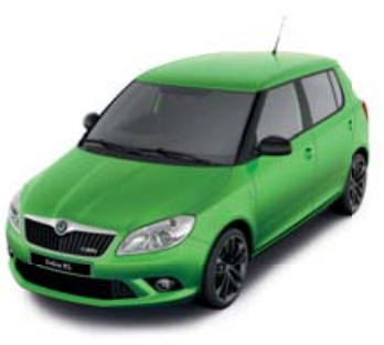
Rallye Green metallic