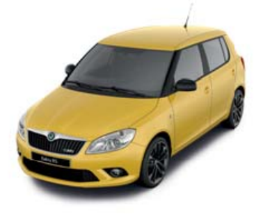
Sprint Yellow special