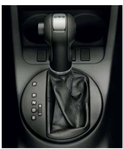
The 1.4 TSI/132kW engine, delivered along with the 7-speed DSG automatic transmission, offers remarkable performance and power in a wide range of revs, as well as economic operation. This engine enables Fabia RS to accelerate from 0 to 100 km/h in just 7.3 seconds.