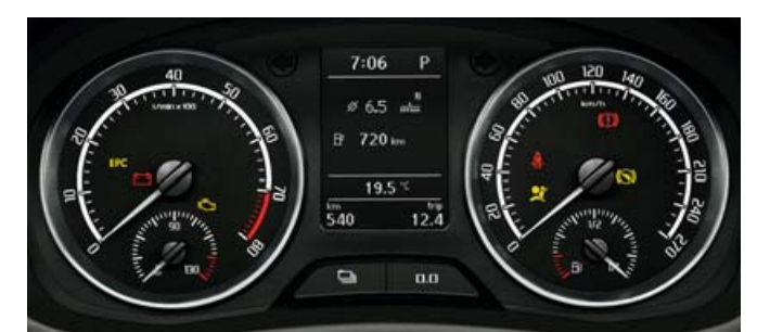
The High-line instrument panel incorporates the Maxi DOT multifunctional display which, among other details, displays the current DSG automatic transmission speed gear.