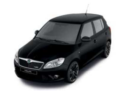
Black Magic pearl effect