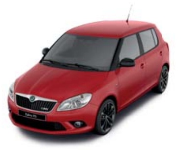
Corrida Red uni