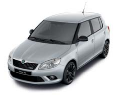
Brilliant Silver metallic