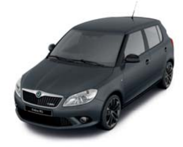
Anthracite Grey metallic