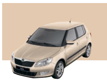
Safari metallic* 8S8S

Because of errors which may occur in the print, the colours illustrated here may differ from the actual finishes themselves. Your Skoda retailer will be pleased to advise you. Please see your local retailer for samples.