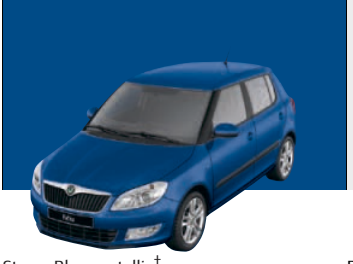
Storm Blue metallic<sup>†</sup> 8D8D