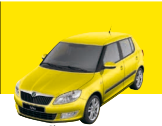
Sprint Yellow**† F2F2