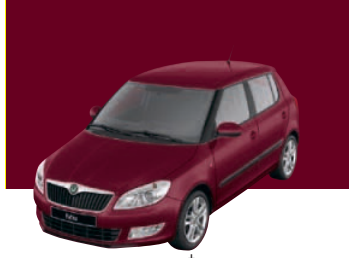
Rosso Brunello metallic<sup>†</sup> X7X7