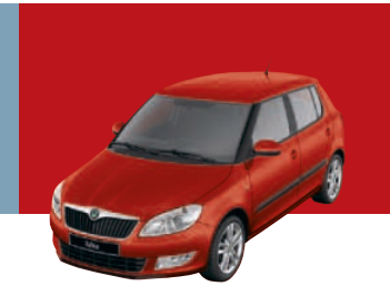
Corrida Red<sup>†</sup> 8T8T