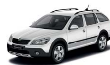
Candy White uni