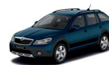
Pacific Blue uni