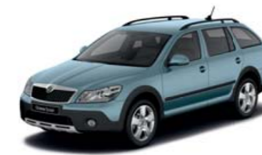
Satin Grey metallic