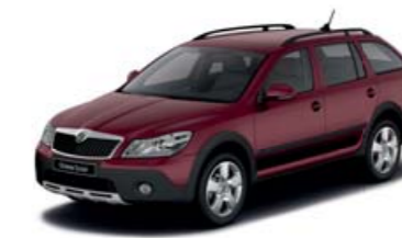
Rosso Brunello metallic