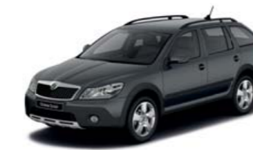
Anthracite Grey metallic