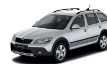
Brilliant Silver metallic