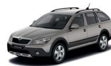
Cappuccino Beige metallic