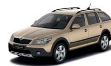
Safari Beige metallic