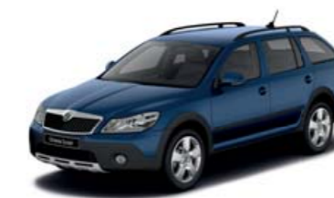
Storm Blue metallic