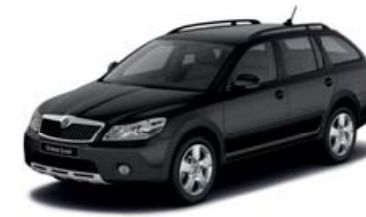
Black Magic pearl effect