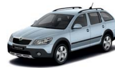
Aqua Blue metallic