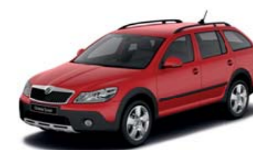
Corrida Red uni