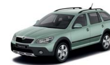
Arctic Green metallic