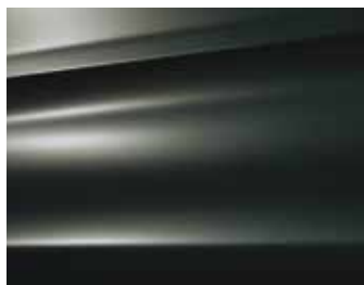
Garrigue Grey (metallic)