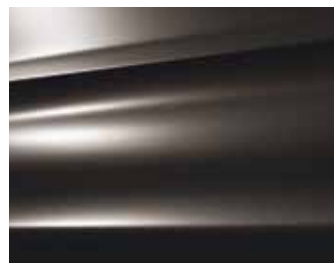
Mangaro Brown (metallic)