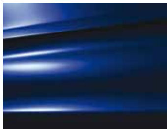
Muzzano Blue (metallic)