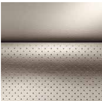
Standard on Exclusive models