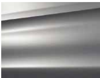
Cool Silver (metallic)