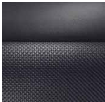
Standard on VTR+ models