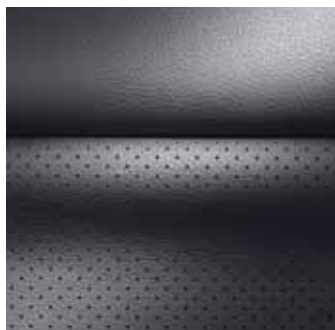
Standard on Exclusive models