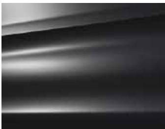
Purplish Grey (pearlescent)