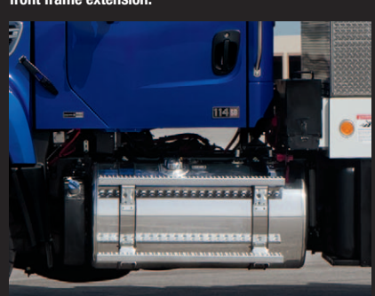
Fuel and DEF tank packaging for ease of body upfit.