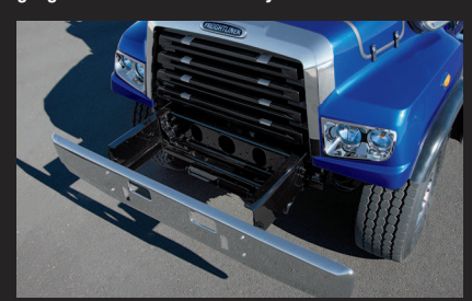
Tilt hood with radiator-mounted stationary grille and front frame extension.