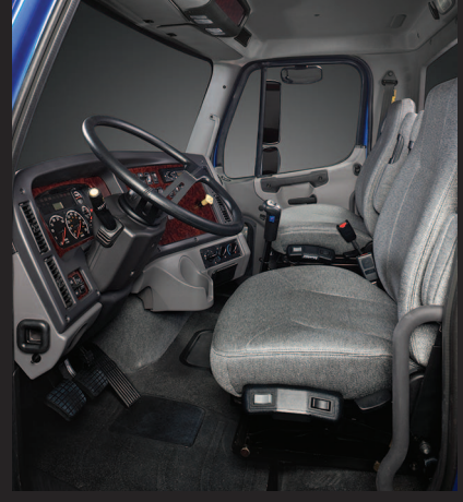
Ergonomically designed driver's area features an automotive-style dash, easy-to-read LED-backlit gauges and controls within easy reach.