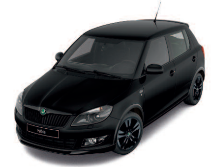
Black Magic Pearl Effect 1Z1Z