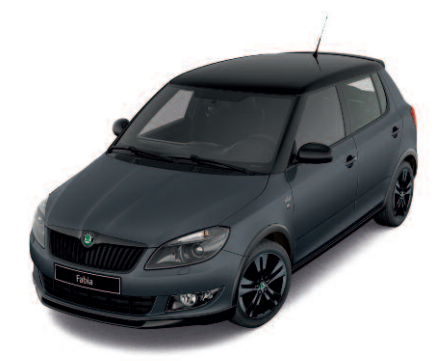
Anthracite Grey metallic 9J9J