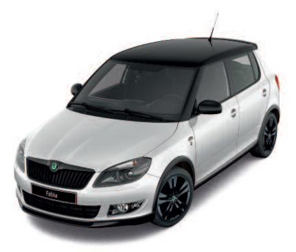
Candy White 9P9P