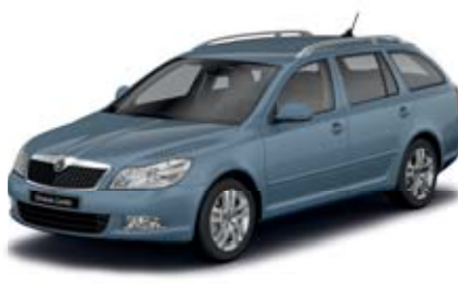
ŠKODA Octavia Combi