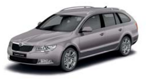
ŠKODA Superb Combi