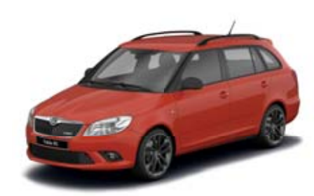
ŠKODA Fabia Combi RS