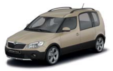
ŠKODA Roomster Scout