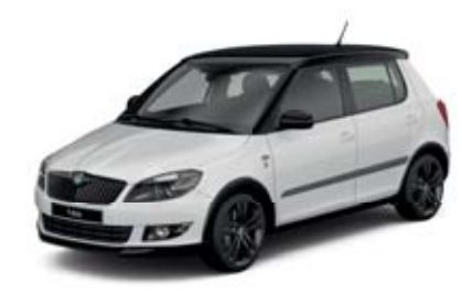
ŠKODA Fabia Monte Carlo