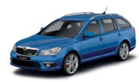
ŠKODA Octavia Combi RS