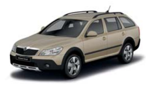
ŠKODA Octavia Scout