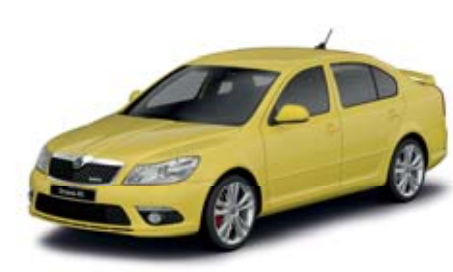
ŠKODA Octavia RS