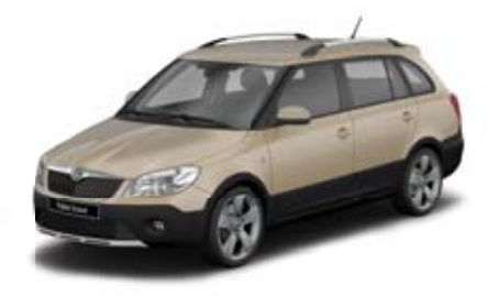
ŠKODA Fabia Combi Scout