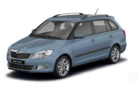
ŠKODA Fabia Combi