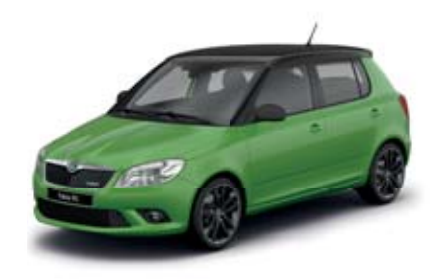
ŠKODA Fabia RS