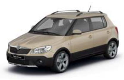
ŠKODA Fabia Scout