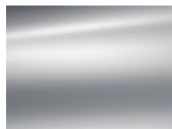
Cool Silver (M)