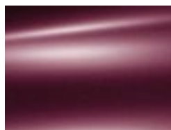
Raspberry Red (M)