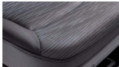
Cloth Seat Trim