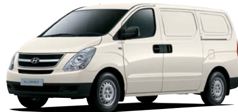
Creamy White – Solid