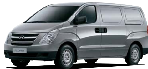
Hyper Silver – Metallic