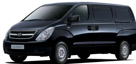
Timeless Black – Mica