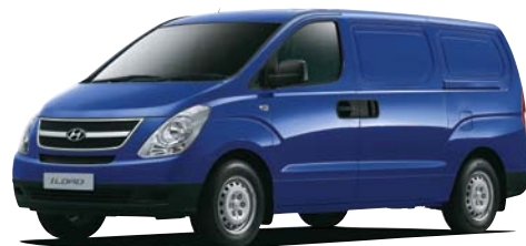
Blue Shift – Mica