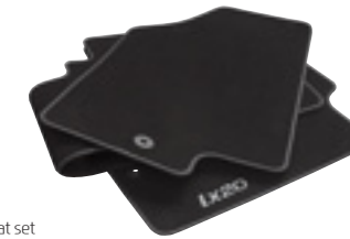
Carpet mat set