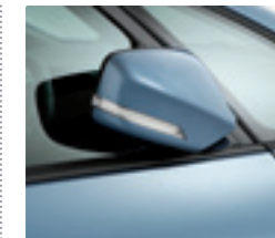
Electrically heated folding door mirrors