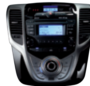
Gloss black and alloy effect facia trim