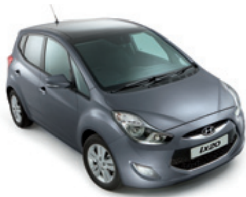
Steel Grey (Metallic)