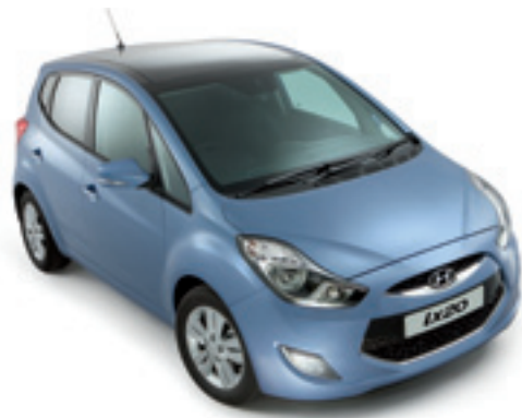
Ice Blue (Metallic)