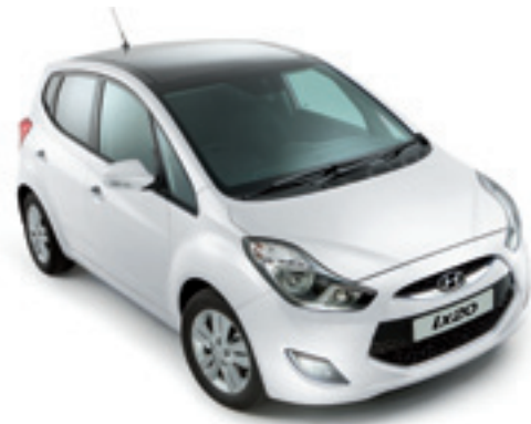
Creamy White (Solid)