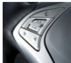
Steering wheel audio controls