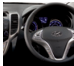
Leather steering wheel