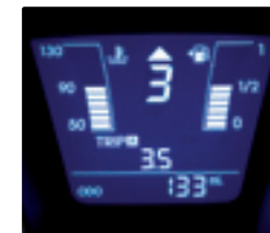
Eco drive indicator*

* Not available with automatic transmission.