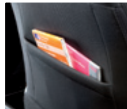
Front seat back pockets