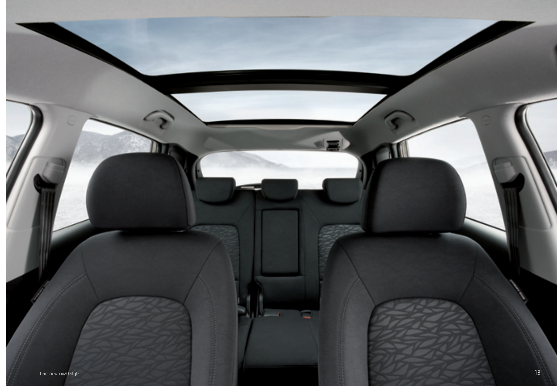
Car shown ix20 Style.

find the perfect temperature thanks to air conditioning. It means you can enjoy a hot blast of air to warm you up for winter, or a cool, refreshing breeze during the summer months. On the Style, you'll also benefit from a sophisticated panoramic sunroof that creates the feel of space and light, as well as stylish privacy glass to reduce the sun's rays and keep you cool on the inside. You can sit back, relax and simply enjoy the ride.