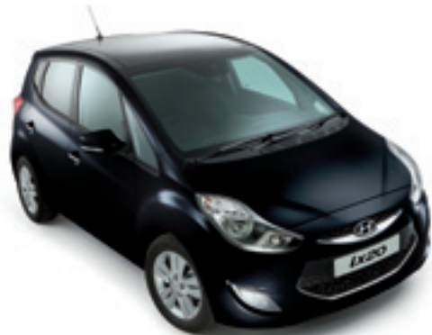
Phantom Black (Metallic)