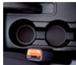
Front cup holders