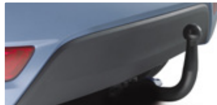
Tow bar – detachable