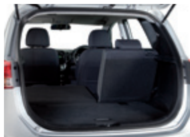
Seat Configuration 3