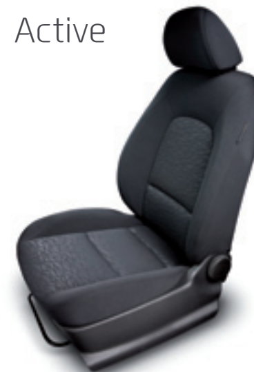
Black cloth incorporating eco pattern design