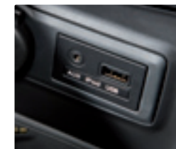
USB & aux connections