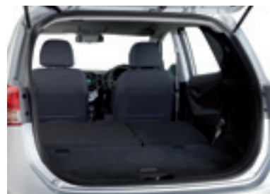
Seat Configuration 4