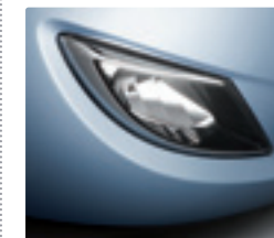
Front fog lights