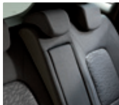
Sliding and reclining rear seat