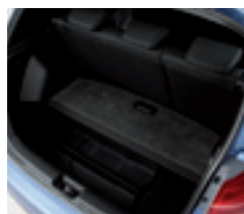
Adjustable boot floor