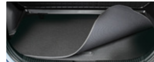
Boot mat – reversible