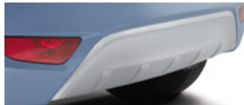
Rear skid plate