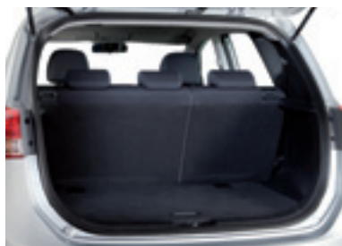
Seat Configuration 1

The ix20 is extremely flexible, with a range of configurations designed to suit your requirements. Whether you need to fit in a car full of luggage, or pick up your kids from school, you can adjust the seats to your preferred setting. There are also a variety of convenient storage spaces that you'll really appreciate.