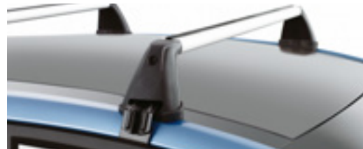
Roof bars – aluminum