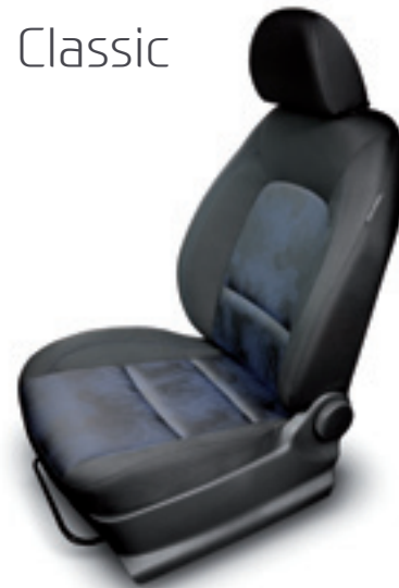
Black cloth with black and blue pattern detail