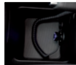
Change to 12v Power outlets (front and boot)