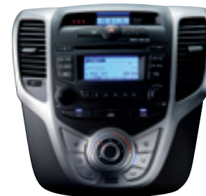
Alloy effect facia trim