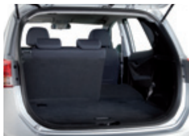
Seat Configuration 2