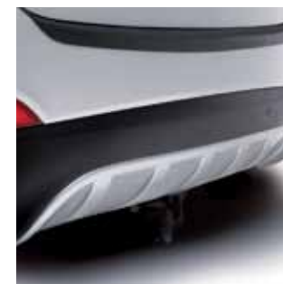
Rear skid plate