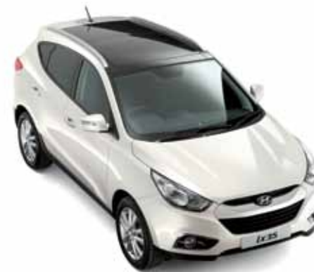
Creamy White - Solid