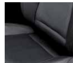
Black leather and cloth seat trim

It's all about choice in the Hyundai ix35. Once you've decided on your preferred model, you'll either have black cloth upholstery on Style or black leather and cloth on Premium. Pick your favourite from our range of exterior colours. Choose from a fresh Ice Blue to a moody Phantom Black, to make your car look exactly the way you want.