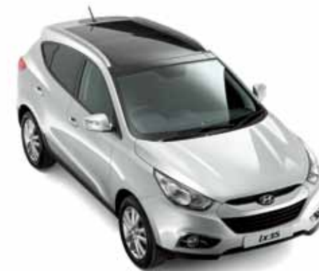
Sleek Silver - Metallic