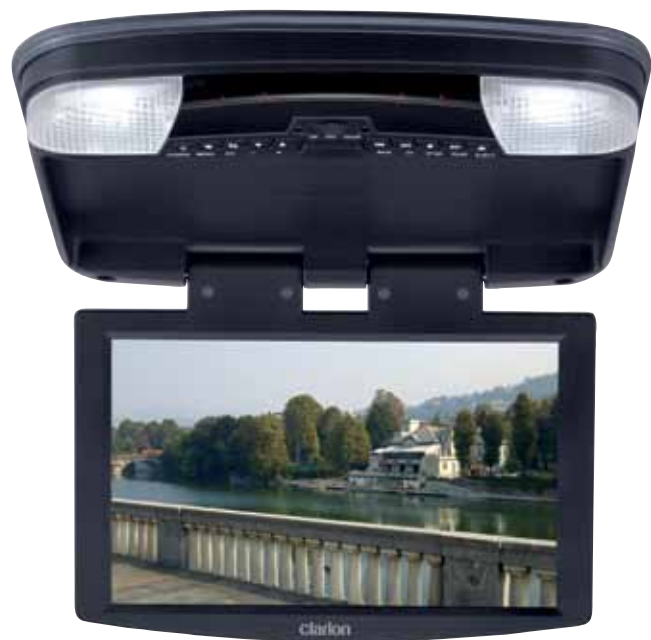
Overhead DVD System

There are a variety of Hyundai accessories that you can add to your ix35, so you can customise your model even further. Inside the car you can opt for an overhead DVD system to keep your kids amused, while on the outside you might choose to add mud flaps to protect the paintwork. Just read through our options, speak to your local Hyundai Dealer, or visit our website.