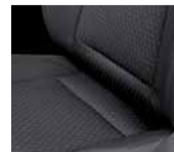
Black cloth seat trim