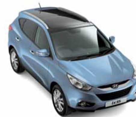
Ice Blue - Metallic