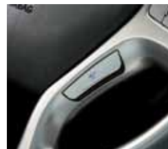
Bluetooth® connectivity with voice recognition