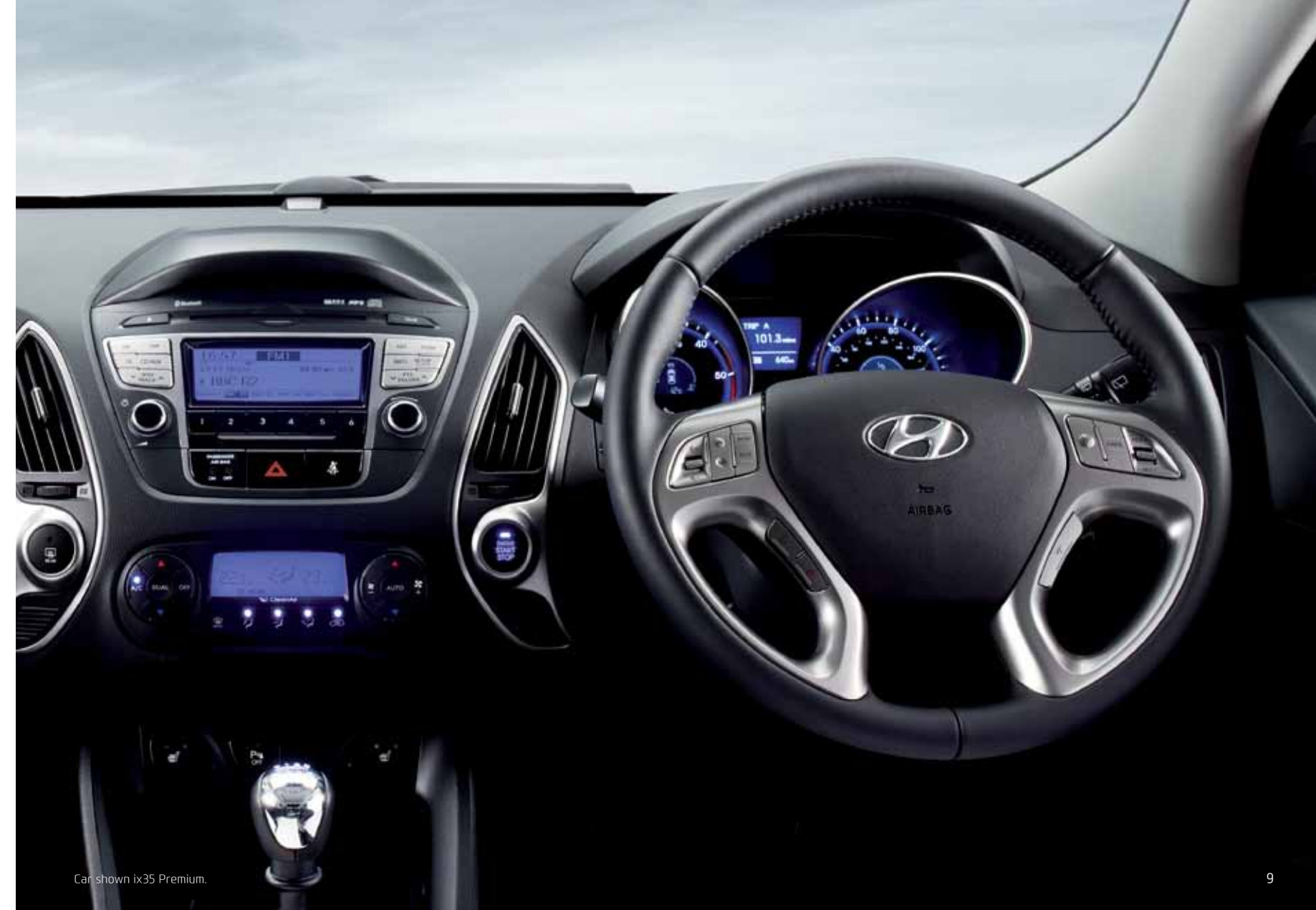
Car shown ix35 Premium.

covered in soothing blue lighting and feel the controls at your fingertips. With attention to detail like this, you'd be forgiven for wanting to make every journey last just that little bit longer. There's more to driving than just getting from A to B. Let the Hyundai ix35 carry you there in style.