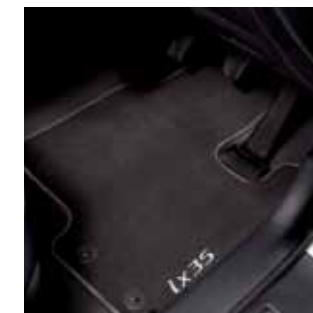
Carpet mat set