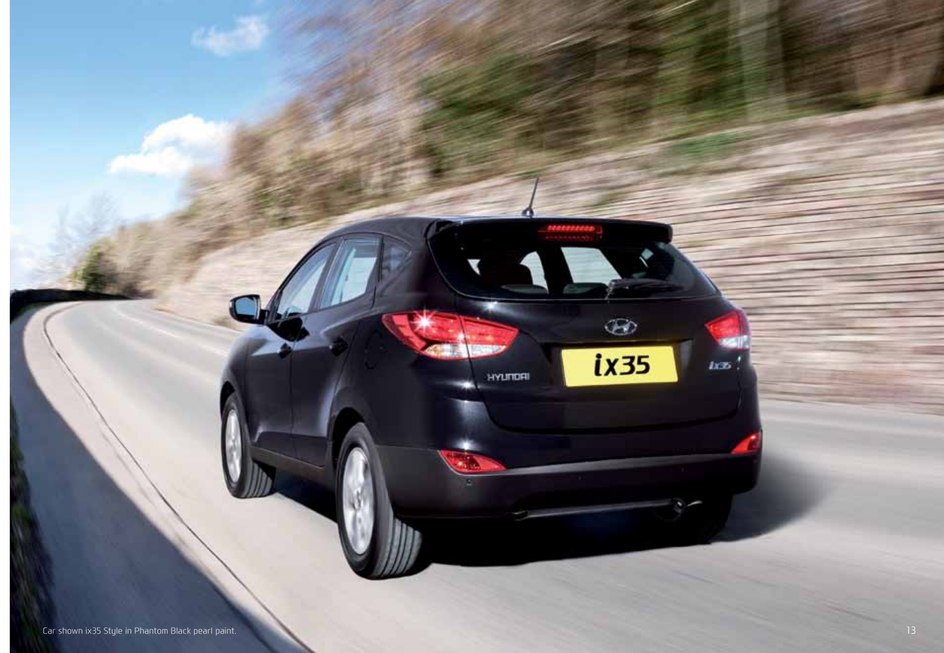
Car shown ix35 Style in Phantom Black pearl paint.

your MP3 player means that you can easily choose the perfect music to suit your mood. Bluetooth® helps you stay in touch while you're on the road, and reversing sensors as standard will help you safely park when you get to your destination. Cruise control on the Premium model makes driving even more relaxing. That's without even mentioning keyless entry with engine start/stop button means you can always access your car quickly and efficiently. In short, the ix35 lets you enjoy the driving experience you've always wanted.