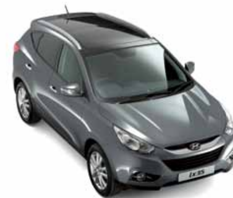
Steel Grey - Metallic

It's all about choice in the Hyundai ix35. Once you've decided on your preferred model, you'll either have black cloth upholstery on Style or black leather and cloth on Premium. Pick your favourite from our range of exterior colours. Choose from a fresh Ice Blue to a moody Phantom Black, to make your car look exactly the way you want.