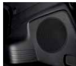
7 speakers including amp & subwoofer