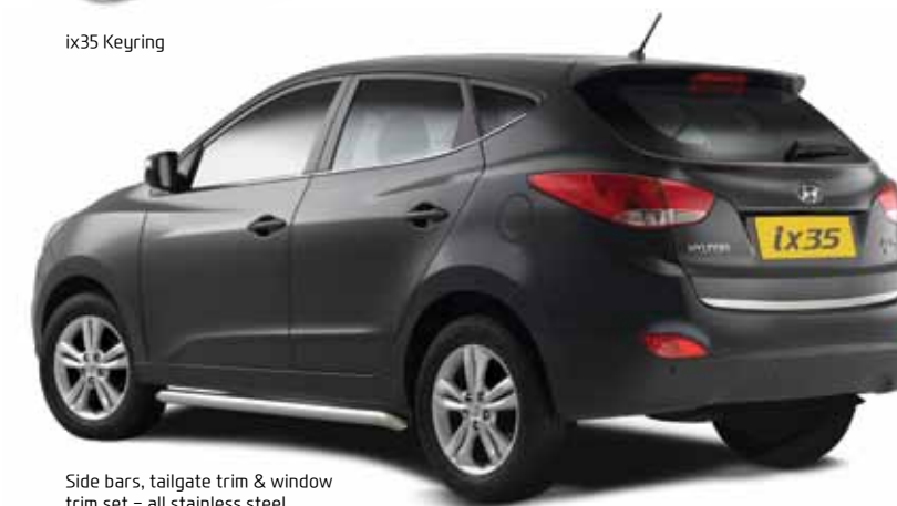
Side bars, tailgate trim & window trim set – all stainless steel