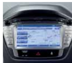
Touchscreen satellite navigation

The Media Pack comes with touchscreen satellite navigation, so you'll be able to find your way to your destination quickly and easily. During the journey you'll listen to your favourite songs with excellent sound quality - taking advantage of seven speakers, as well as an amp and subwoofer. And once you arrive, you'll be able to take advantage of a rear view parking camera to guide you safely into the tightest of spaces. The Media Pack's state-of-the-art features will enhance your driving experience every step of the way.