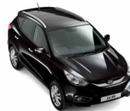
Phantom Black - Pearl