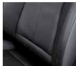
Leather seat trim