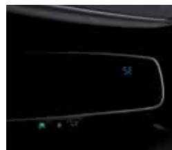
Automatic dimming rear view mirror with compass