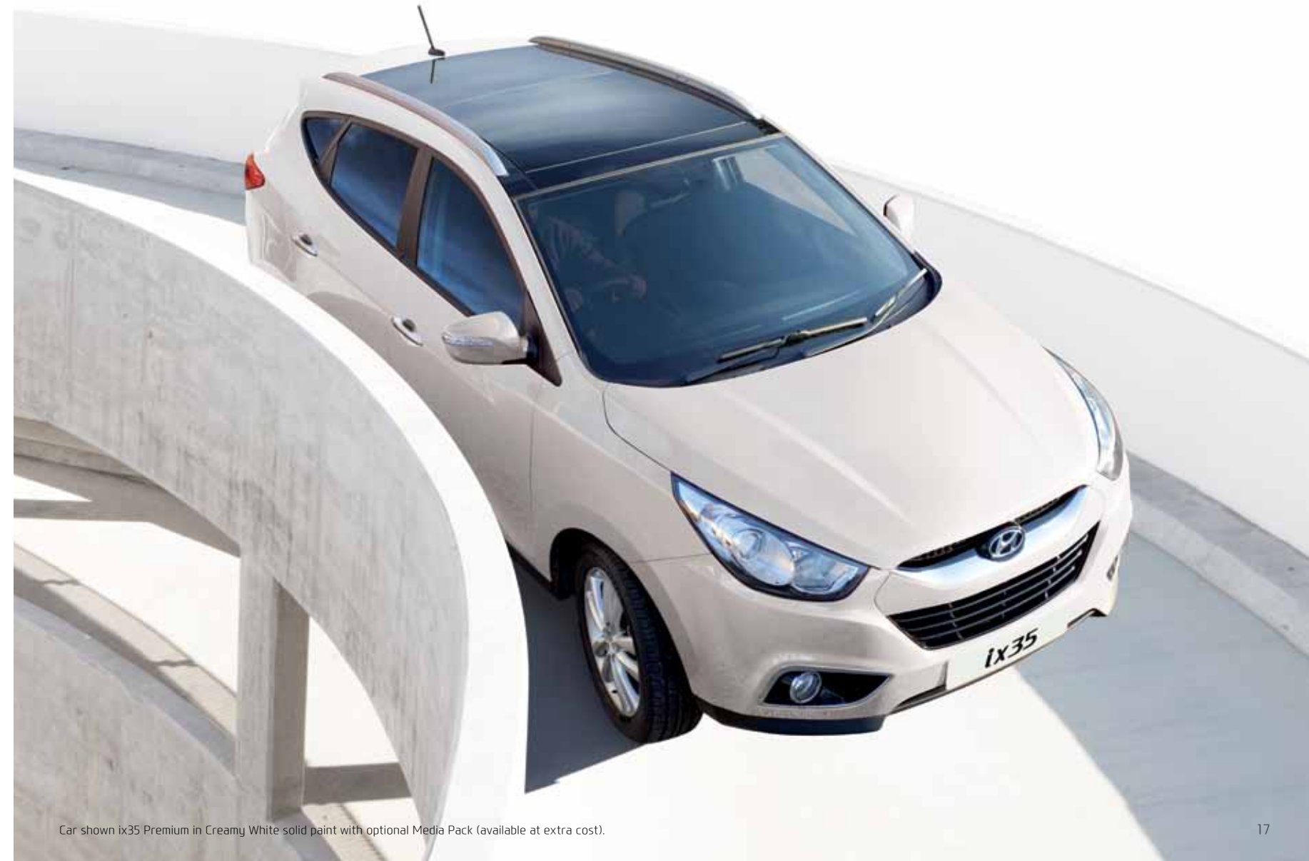
Car shown ix35 Premium in Creamy White solid paint with optional Media Pack (available at extra cost).

control, as well as the Anti-lock Brakes which give you more composure and precision when you need it most. And of course, you can count on the highest levels of protection from the high tensile steel body shell, rear ISOfix child seat anchorage points, active front head restraints and six airbags. All Hyundai ix35's also have an impressive five star EURO NCAP rating so you can rest assured that you and your passengers are travelling with the ultimate protection. When it comes to safety and security, the Hyundai ix35 gives you all the reassurance you need.