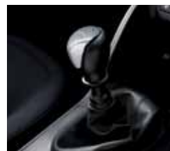
Leather gear knob