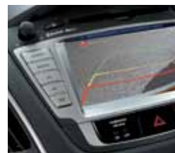
Rear view parking camera