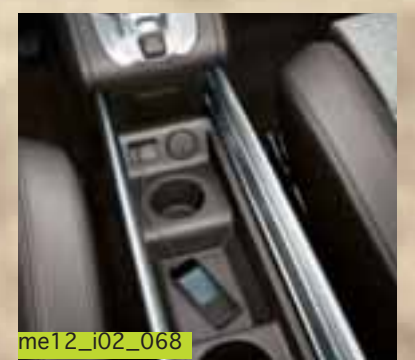
USB and aux-in. Quick, convenient, and easy to use, the USB and aux-in connectors let you plug in your MP3 player, memory stick, PC, or other mobile devices.

Stay informed, entertained, and in touch. Whatever unit you choose from the infotainment programme in Opel Meriva, you'll enjoy great sound, easy connectivity, and intuitive controls.