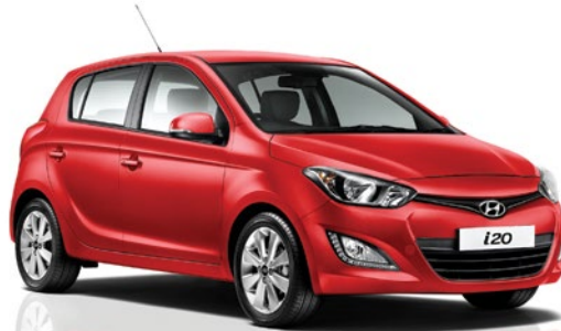
Electric Red - Solid