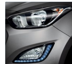
Automatic headlights and LED daytime running lights