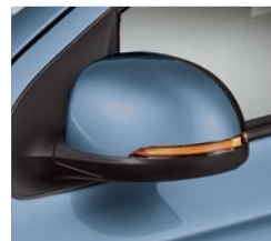
Electrically heated and folding door mirrors (5 door)