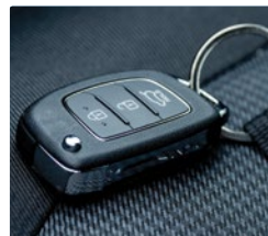
Remote central locking