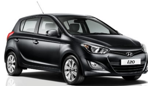
Phantom Black - Metallic