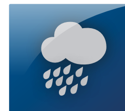
Rain sensing front windscreen wipers