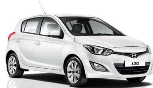
Coral White - Solid