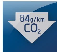
Lower CO 2 emissions