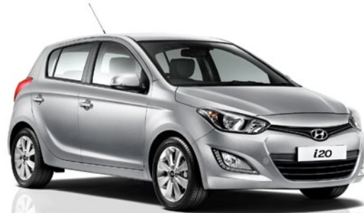
Sleek Silver - Metallic