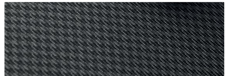
Black & Grey Cloth