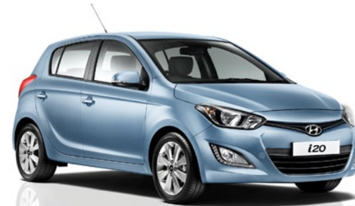
Clean Blue - Pearl (Active & Style only)