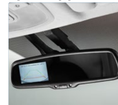
Reversing camera in rear view mirror