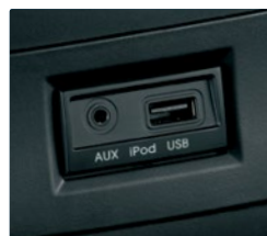
USB and aux connections