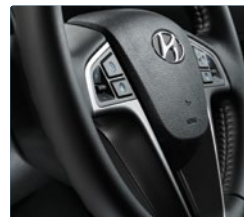
Leather steering wheel