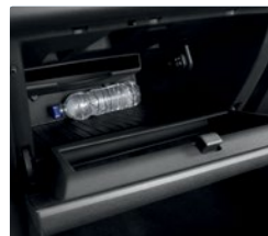
Air conditioning with glove compartment cooling function