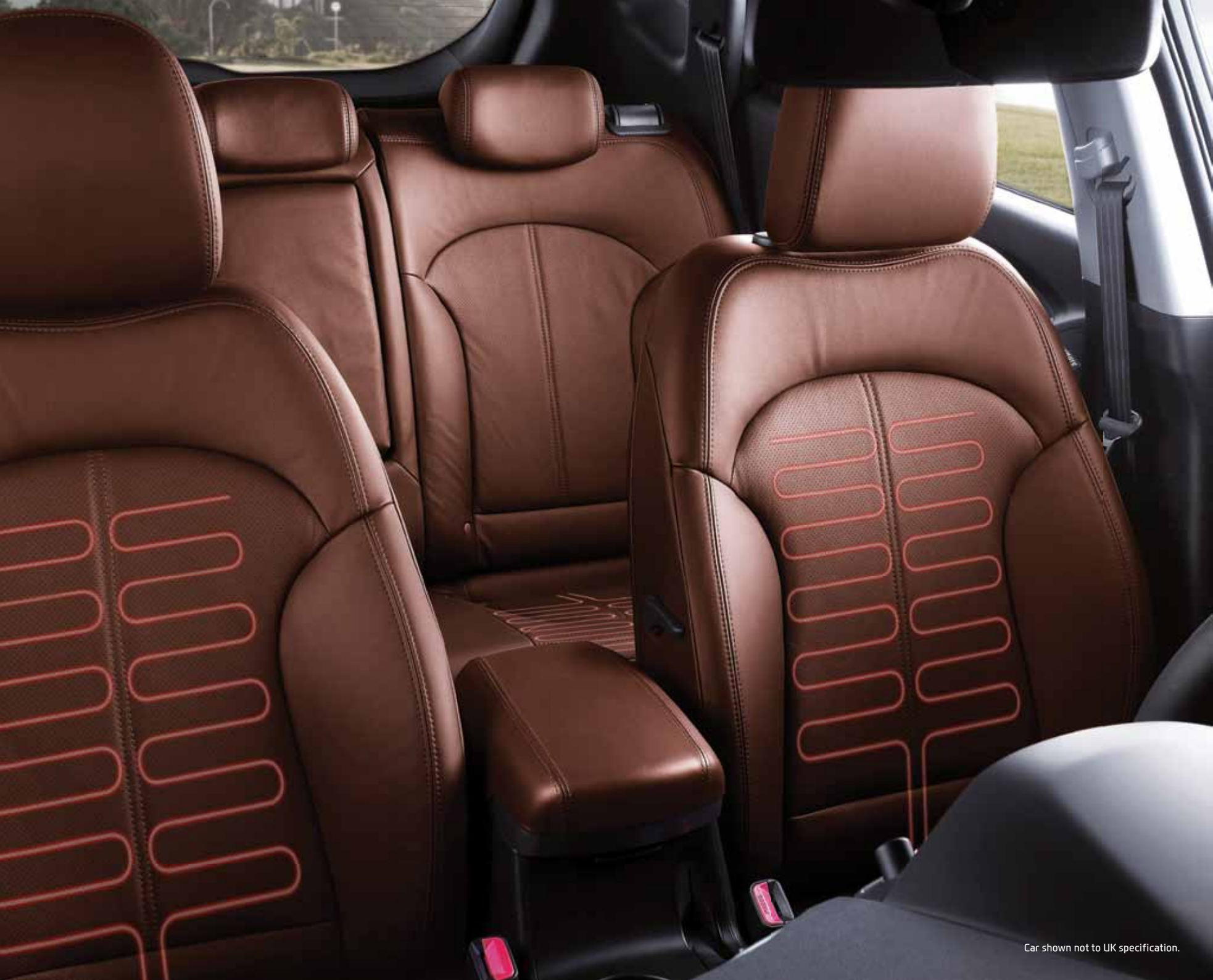
Car shown not to UK specification.