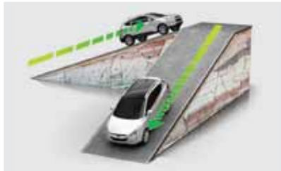
For greater stability on tricky surfaces, the 4WD system takes into account road condition, wheel speed and acceleration and distributes the torque between front and rear wheels.