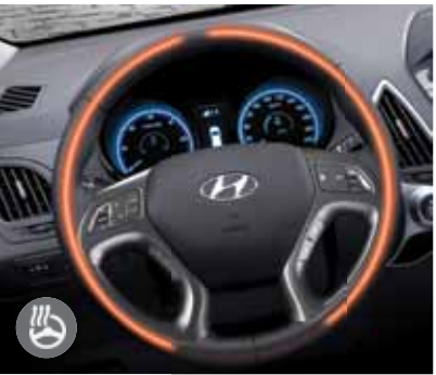
With air conditioning, luxury comes as standard.