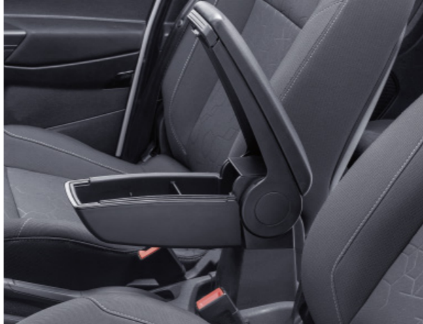
Polytec* Armrest Designed to complement the interior styling of your car, these armrests add more comfort to your journey and increase your storage capacity.