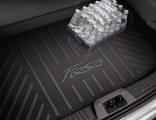
Boot Liner Ford's Boot Liner's come with a durable rubber anti-slip surface to protect your boot.