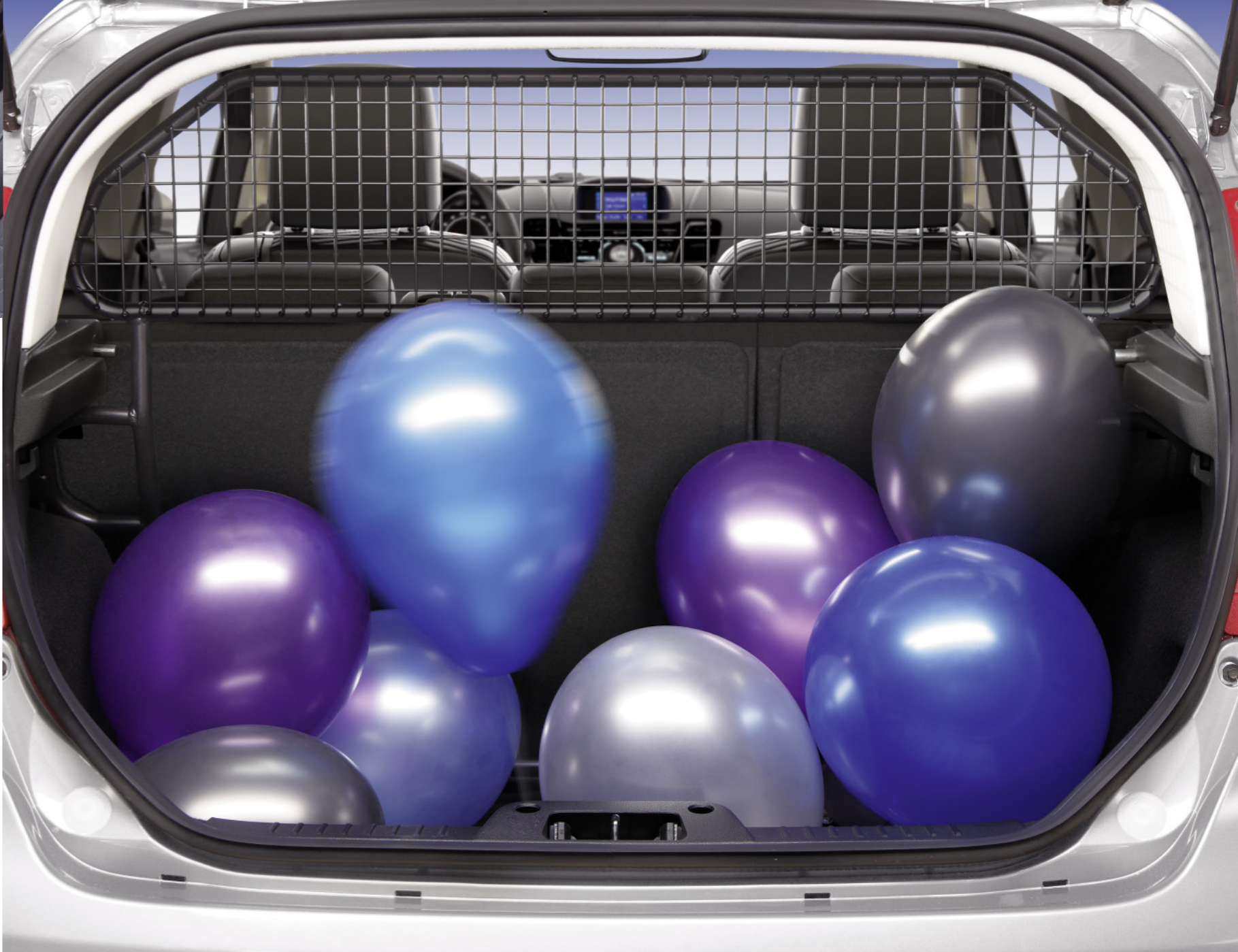
Load Retention Guard Ford's load retention and dog guards keep your dogs and load safely inside your boot, even under heavy braking.

You can travel in safety when your load is stored securely. Ford load compartment accessories are designed and tested to fit perfectly and stay in place, keeping loads where they should be even under heavy braking. Load retention guards and load retention nets, for example, are crash tested to protect passengers in a crash at up to 50 km/h (31 mph). And to help you keep the load space looking as good as the rest of your Ford's interior, we have accessories to keep it clean, dry and tidy.