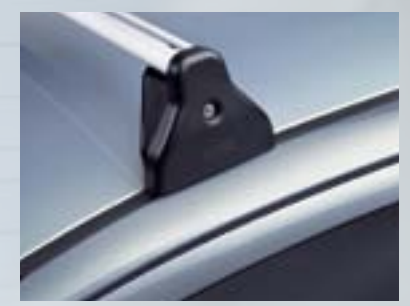
Roof base carrier. The tough and secure base carrier is lockable and allows the fitting of a full range of Opel and Thule attachment system elements like roof boxes, ski or bike carriers.