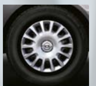
Steel wheel incl. cover, 5.5 J x 14, 14-spoke design, tyres 185/70 R 14