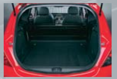
Load area. Opel Corsavan's easy access load space is protected by half-height sidewall panelling and sturdy steel bulkhead. The steel mesh upper bulkhead, the rubber load floor covering, and the full load compartment cover are optional.