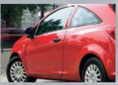
Glazed rear side windows. More light in the interior: the Opel Corsavan can also be ordered as fully glazed version.

automatically stops the engine when the car comes to a standstill. The engine promptly restarts as soon as the clutch is engaged.