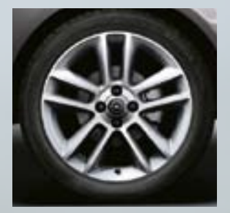
Alloy wheel, 7 J \times 17, 5-twinspoke design, tyres 215/45 R 17