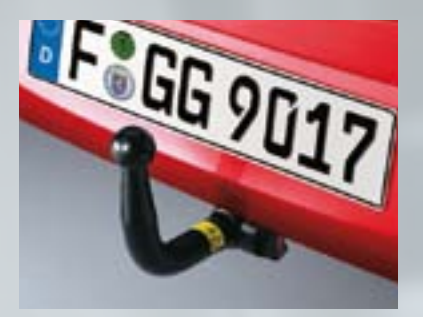
Towing hitch. A towing hitch with removable ball head is available for a maximum towing capacity of up to 1,300 kg.