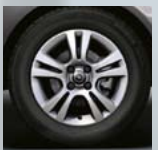
Alloy wheel, 6 J x 15, 5-twinspoke design, tyres 185/65 R 15