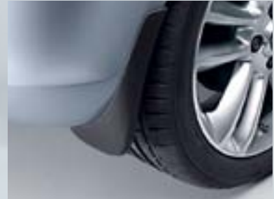
Splash guards. Black-coloured splash guards for effective protection against paint damage and water splashes. Available for front and rear, sets of 2.