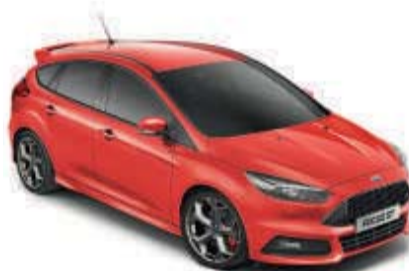
Race Red Solid body colour