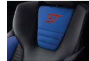
Protection in Lux in Charcoal Black insert, Lux Soft in Spirit Blue bolster (ST-2)*