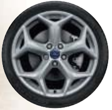
18" alloy wheel (standard ST-1 & ST-2)