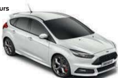
Frozen White Solid body colour †