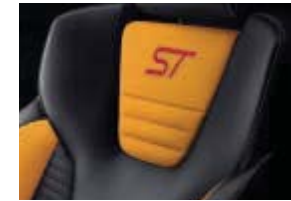
Protection in Lux in Charcoal Black insert, Lux Soft in Tangerine Scream bolster (ST-2)*