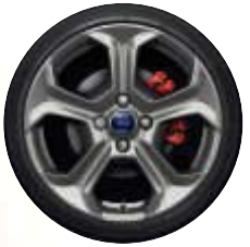
17" 5-spoke Rock Metallic painted alloy wheel (as part of ST Style Pack)