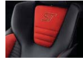
Protection in Lux in Charcoal Black insert, Lux Soft in Race Red bolster (ST-2)*