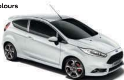
Frozen White Solid body colour †