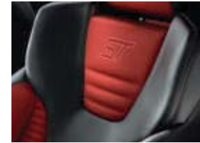
Protection in Molten Orange insert, Torino leather in Charcoal Black/Lux Soft in Molten Orange bolster (ST-2 & ST-3)* (see main image)