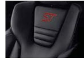
Windsor leather in Charcoal Black insert and bolster (ST-3)

Featuring bold contours, colour-matching stitching and a striking ST insignia on the backrest, Recaro seats communicate the fun and spirited attitude of the ST, whilst providing great comfort and support (image shown left is Fiesta ST partial leather seat in Molten Orange).