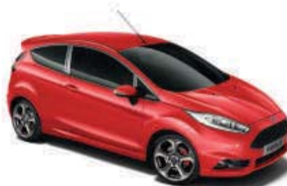
Race Red Solid body colour