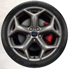
18" Rock Metallic alloy wheel (standard on ST-3 includes red calipers)