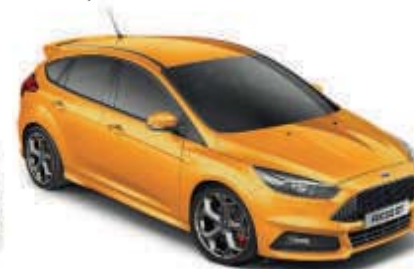
Tangerine Scream** Tri-coat body colour †