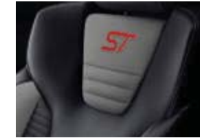
Protection in Lux in Charcoal Black insert, Lux Soft in Smoke Storm bolster (ST-2)*