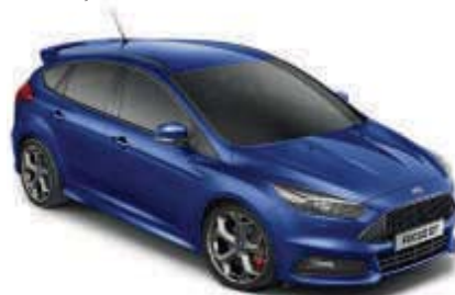
Deep Impact Blue Metallic body colour †