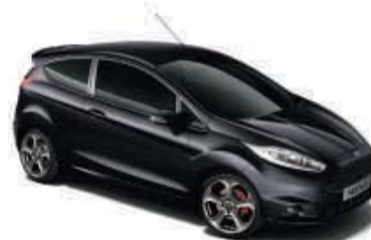
Panther Black Metallic body colour †