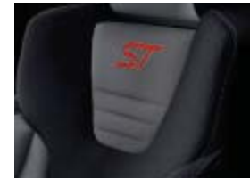
Airfield in Silverstone Grey insert, Lux Soft in Charcoal Black bolster (ST-1)