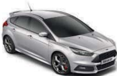
Moondust Silver Metallic body colour †