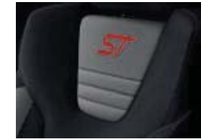
Lux Soft in Charcoal Black insert, Volume in Anthracite bolster (ST-1)