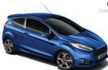
Spirit Blue** Metallic body colour †