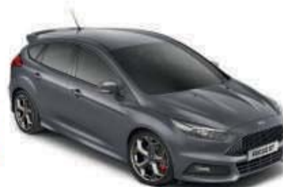
Stealth** Solid body colour