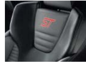
Protection in Smoke Storm insert, Torino leather in Charcoal Black/Lux Soft in Smoke Storm bolster (ST-2 & ST-3)