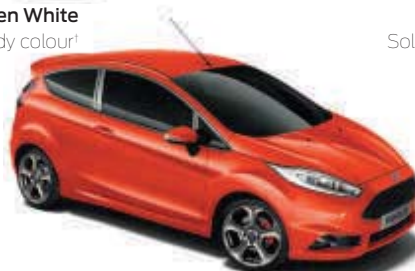
Molten Orange** Pearlescent metallic body colour †