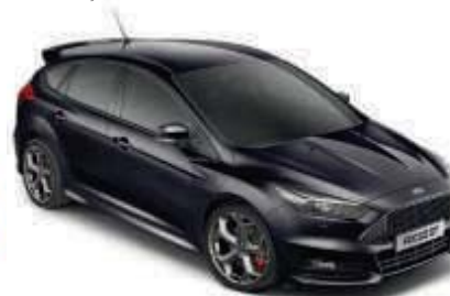
Panther Black Metallic body colour †