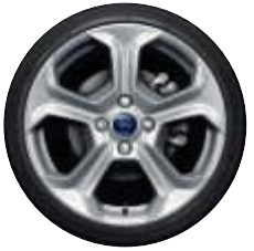
17" 5-spoke alloy wheel (standard)