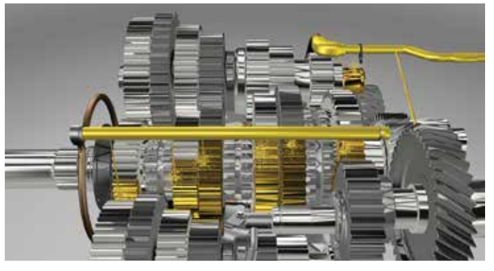
Precision lube system eliminates oil cooler and reduces remaining transmission inefficiencies by nearly one-third.