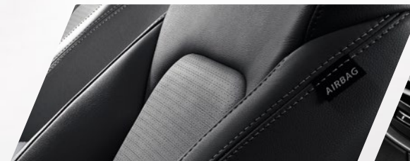
Leather seat trim (seat facings only)