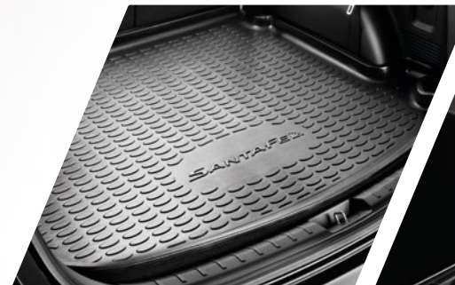
Boot liner – 5 and 7 seat models