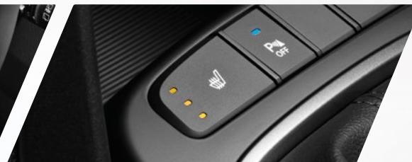
Heated front seats – 3 stage