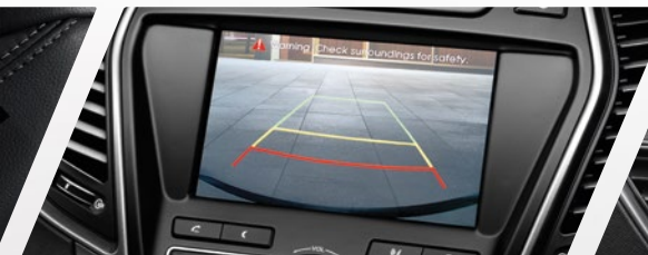
Rear view parking camera