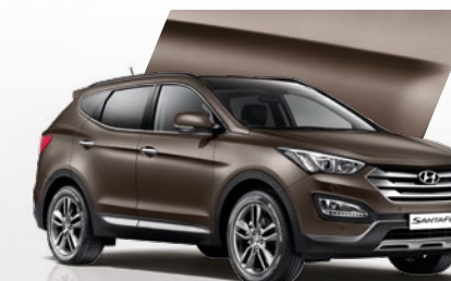
Arabian Mocha - Pearl