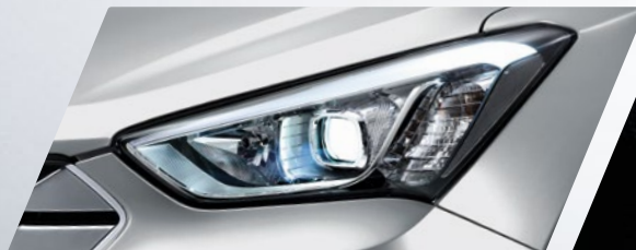
HID Xenon headlights with Adaptive Forward Lighting System (AFLS)