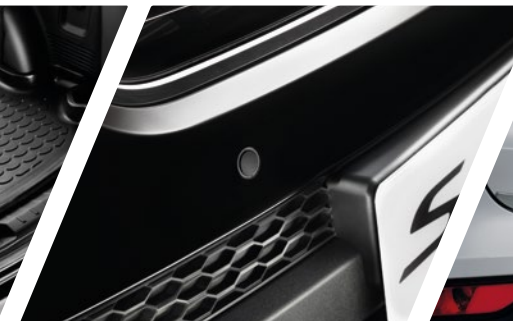
Front parking sensors