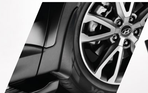
Mud flap set