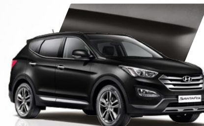
Phantom Black - Metallic