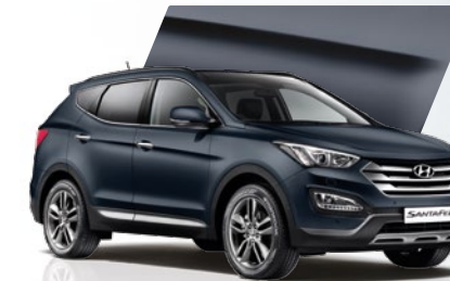
Ocean View - Metallic