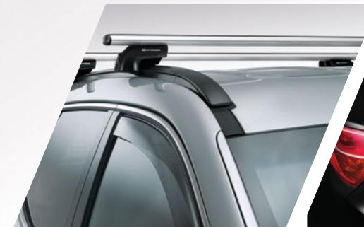
Cross bars – aluminium