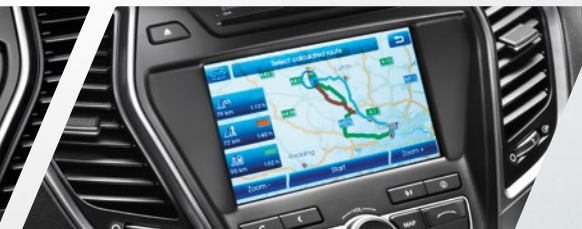
Touchscreen satellite navigation