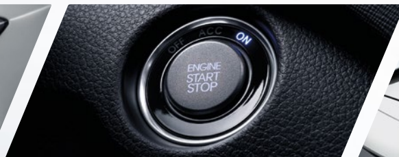
Engine start/stop button