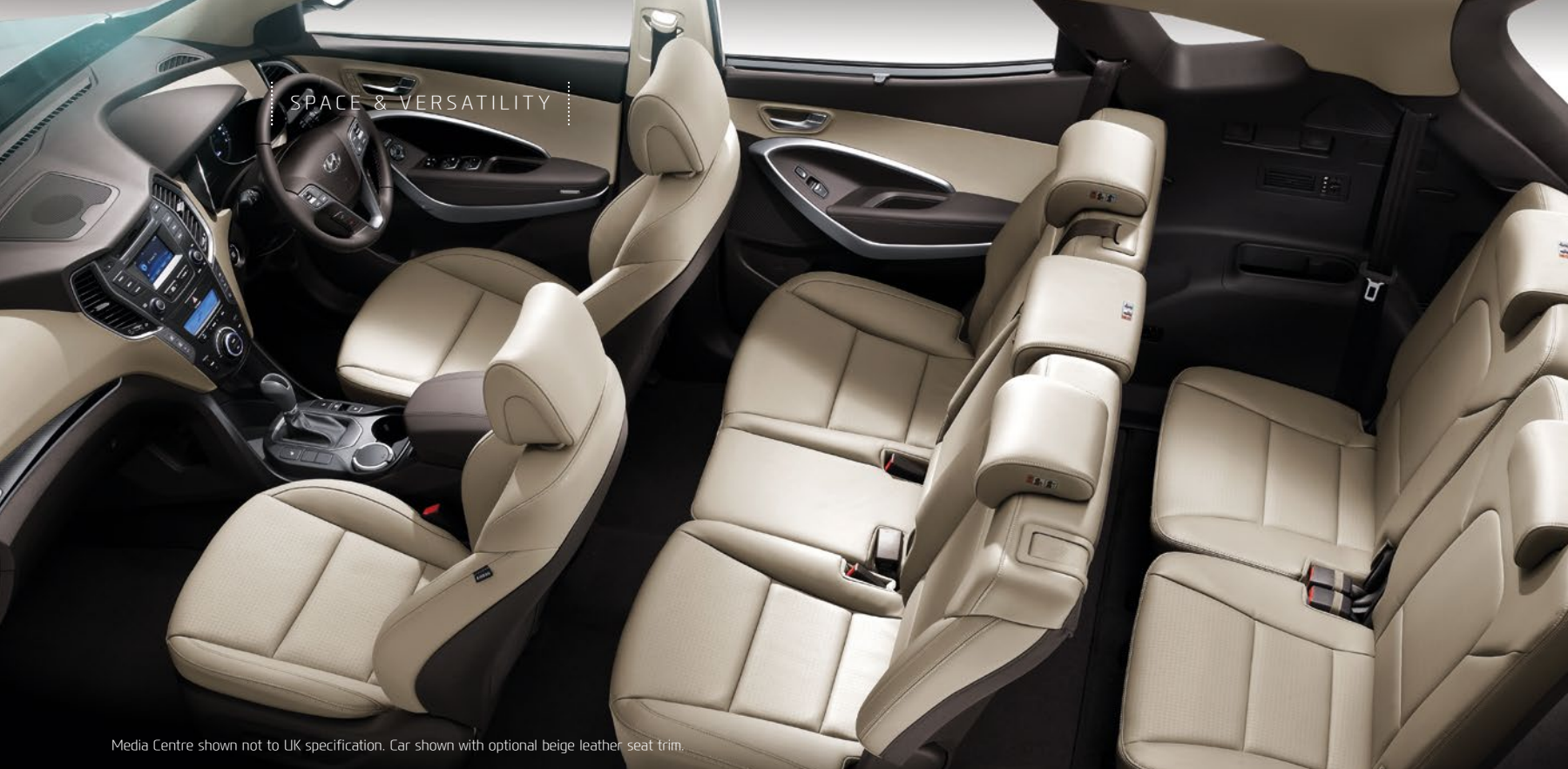
Media Centre shown not to UK specification. Car shown with optional beige leather seat trim.