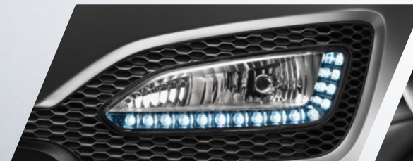
LED daytime running lights