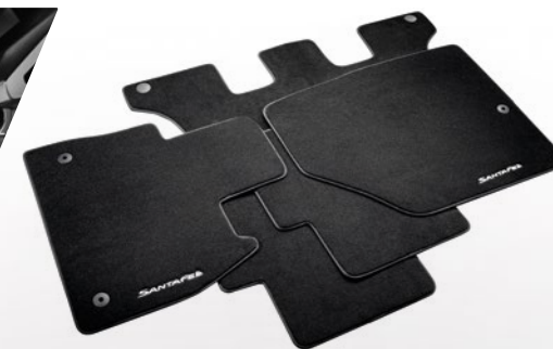
Carpet mat set – 5 and 7 seat models

Car shown Santa Fe Premium in Phantom Black metallic paint. Accessories are based on the latest information available at the time of print. Please consult your Dealer for full details.