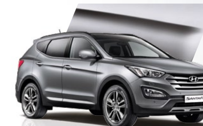
Titanium Silver - Metallic