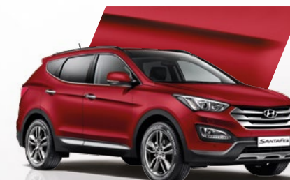
Red Merlot - Pearl