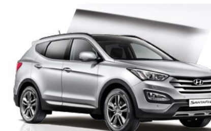
Sleek Silver - Metallic