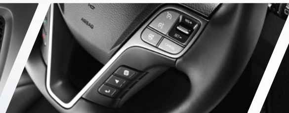
Flex Steer, cruise control with speed limiter