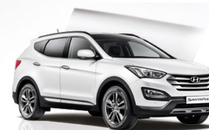
Creamy White - Solid