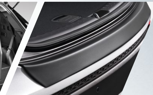
Rear bumper protector – moulded