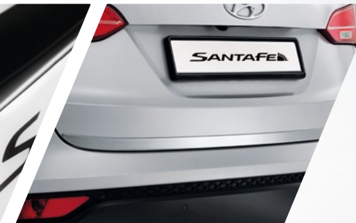
Tailgate trim – chrome