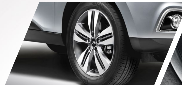
18" alloy wheels