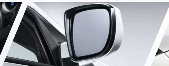
Heated door mirrors