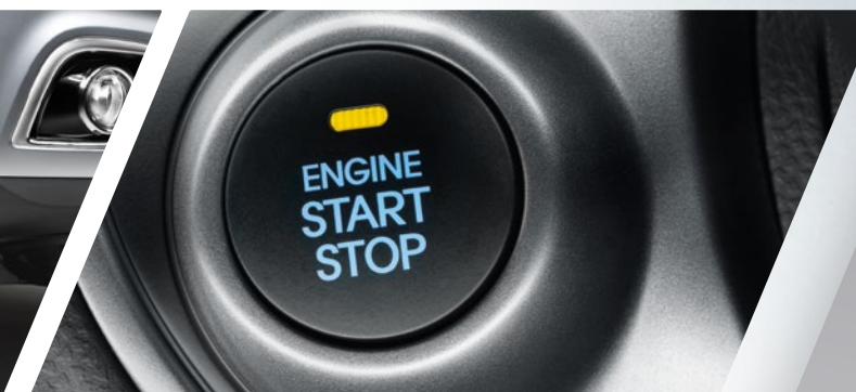
Keyless entry with engine start/stop button