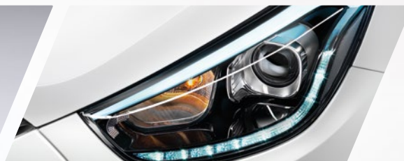
LED daytime running lights and LED positioning lights