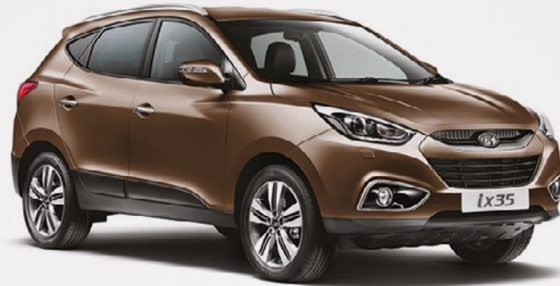
Cashmere - Pearl