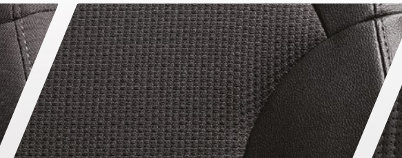
Black leather effect and cloth seat trim (seat facings only) SE and SE Nav models