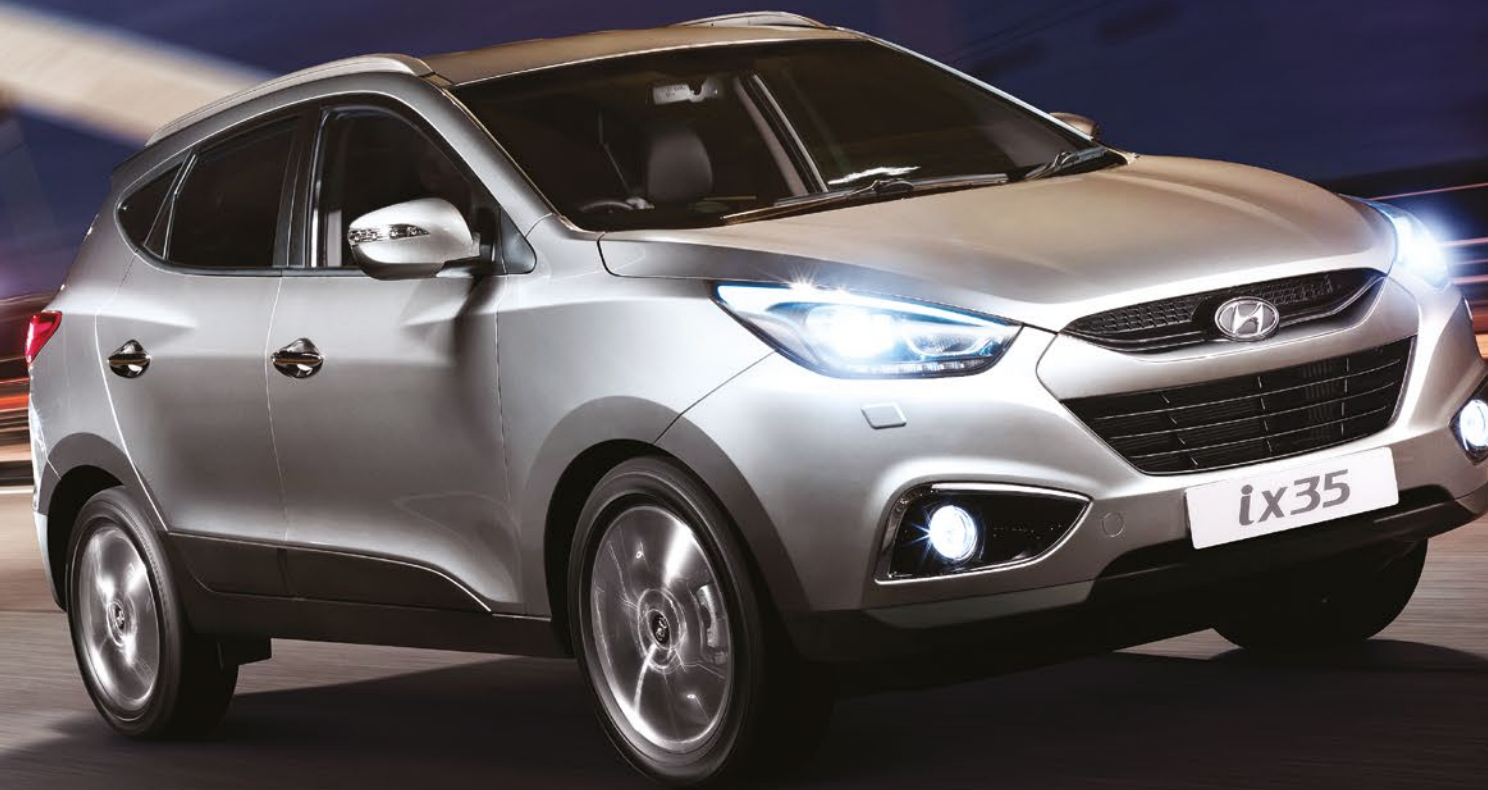
Car shown ix35 Premium in Sleek Silver metallic paint

model, is perfect for urban driving. It'll switch off the engine when you put your car in neutral and lift off the clutch, restarting it instantly when you de-press the clutch, ready to move off. There's also a Tyre Pressure Monitoring System (TPMS) to warn you when your tyres are not at the optimum pressure for efficient driving. Thanks to clever technologies and advanced engines, you can now enjoy driving the ix35 even further between refills.