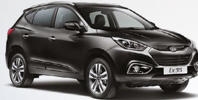
Phantom Black - Pearl