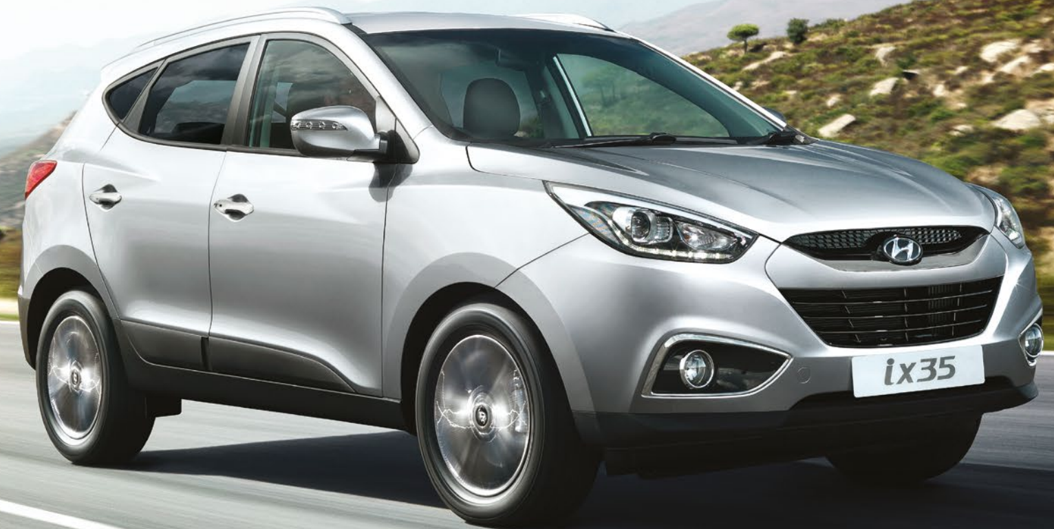
Car shown ix35 Premium in Sleet Silver metallic paint

The highest quality materials, engineered with imagination and precision. It's what makes the ix35 far more than the sum of its parts. The perfect combination of artistic inspiration and technical expertise, it's built to impress and designed for you to enjoy on the open road.