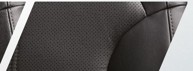
Black leather seat trim (seat facings only) Premium and Premium Panorama models

S models available in Creamy White, Sleek Silver or Phantom Black.