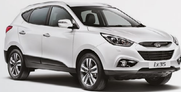
Creamy White - Solid