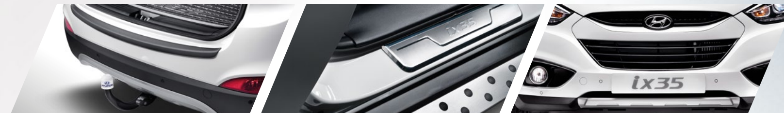
Rear bumper protector and towbar – detachable