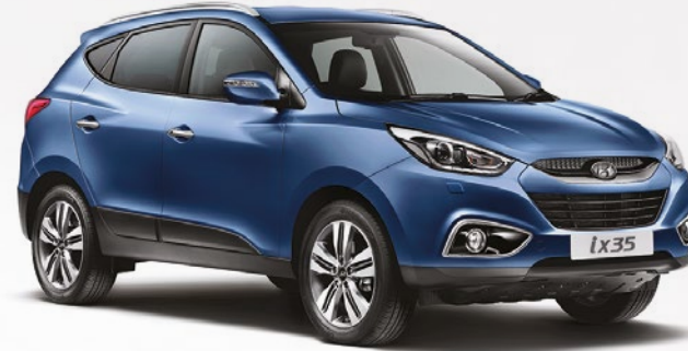
Blueberry - Metallic