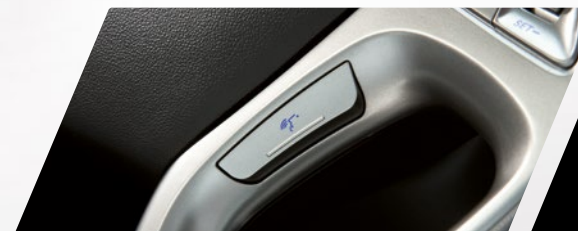
Bluetooth® connectivity with voice recognition