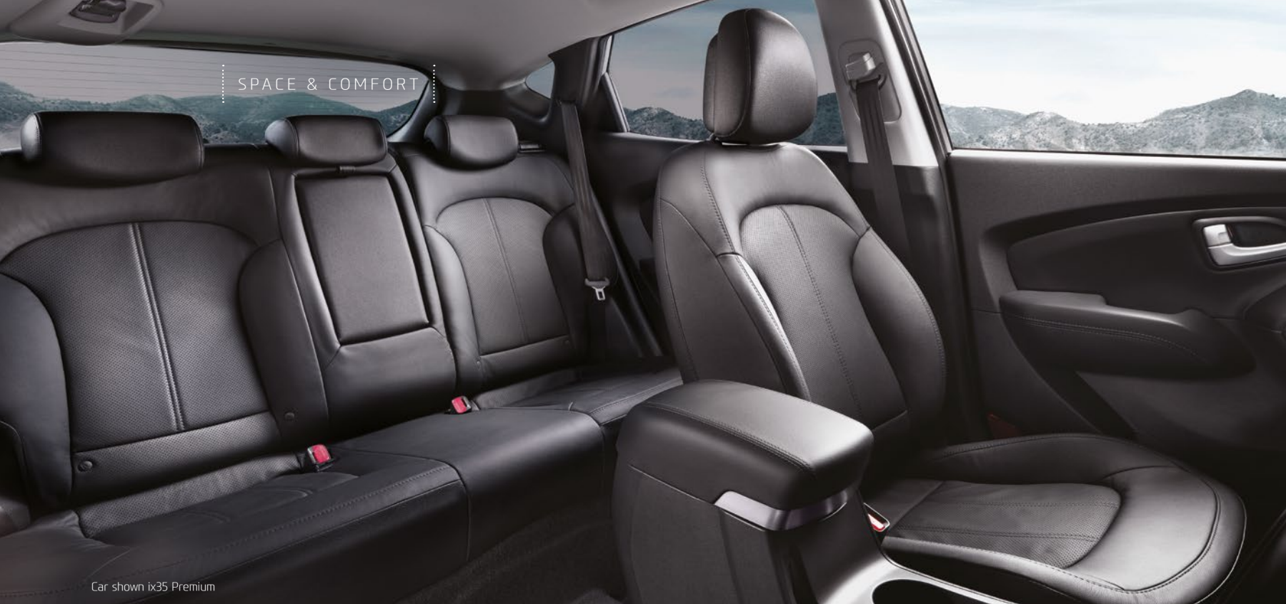
Car shown ix35 Premium