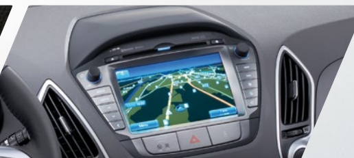
Touchscreen satellite navigation