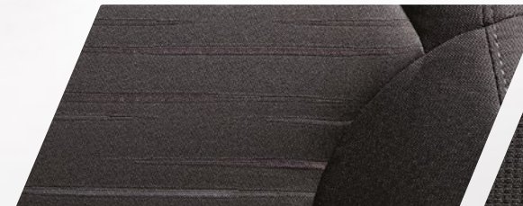
Black cloth seat trim - S models