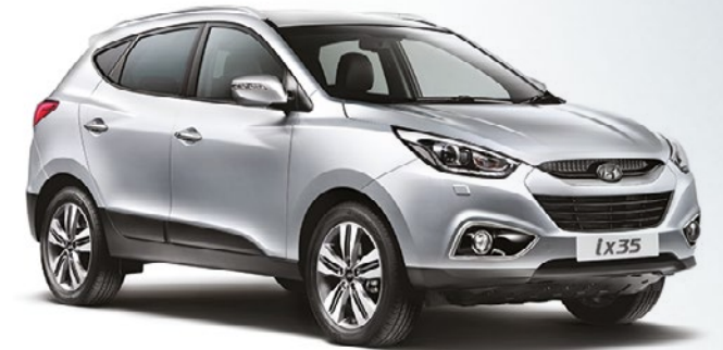
Sleek Silver - Metallic