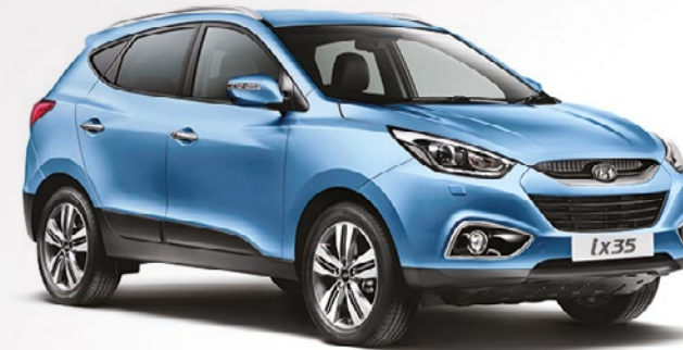
Ice Blue - Metallic