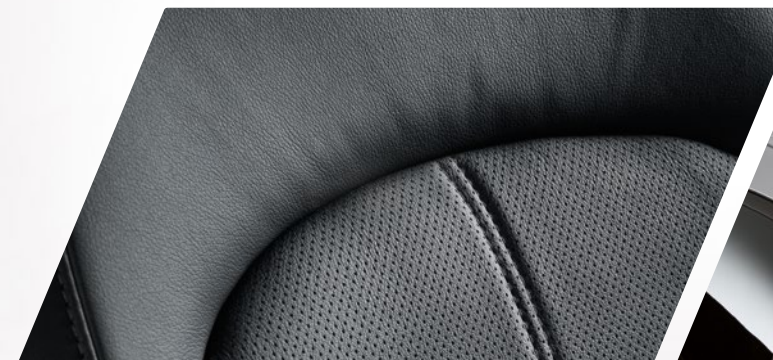
Leather seat trim (seat facings only)