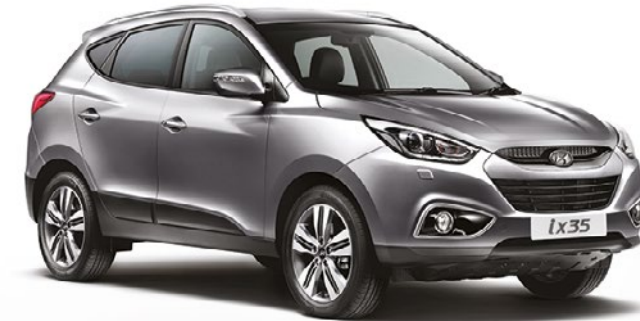
Steel Grey - Metallic