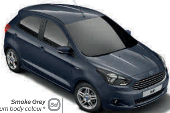
Smoke Grey Sd Premium body colour* Zt