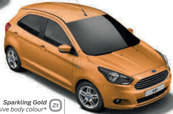
Sparkling Gold Zt Exclusive body colour*