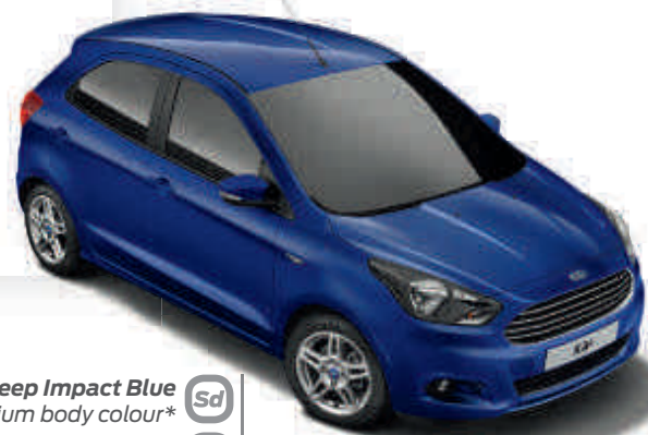
Deep Impact Blue Sd Premium body colour* Zt

The Ford KA+ owes its beautiful and durable exterior to a special multi-stage painting process. From the wax-injected steel body sections to the protective top coat, new materials and application processes ensure your KA+ will retain its good looks for many years to come.