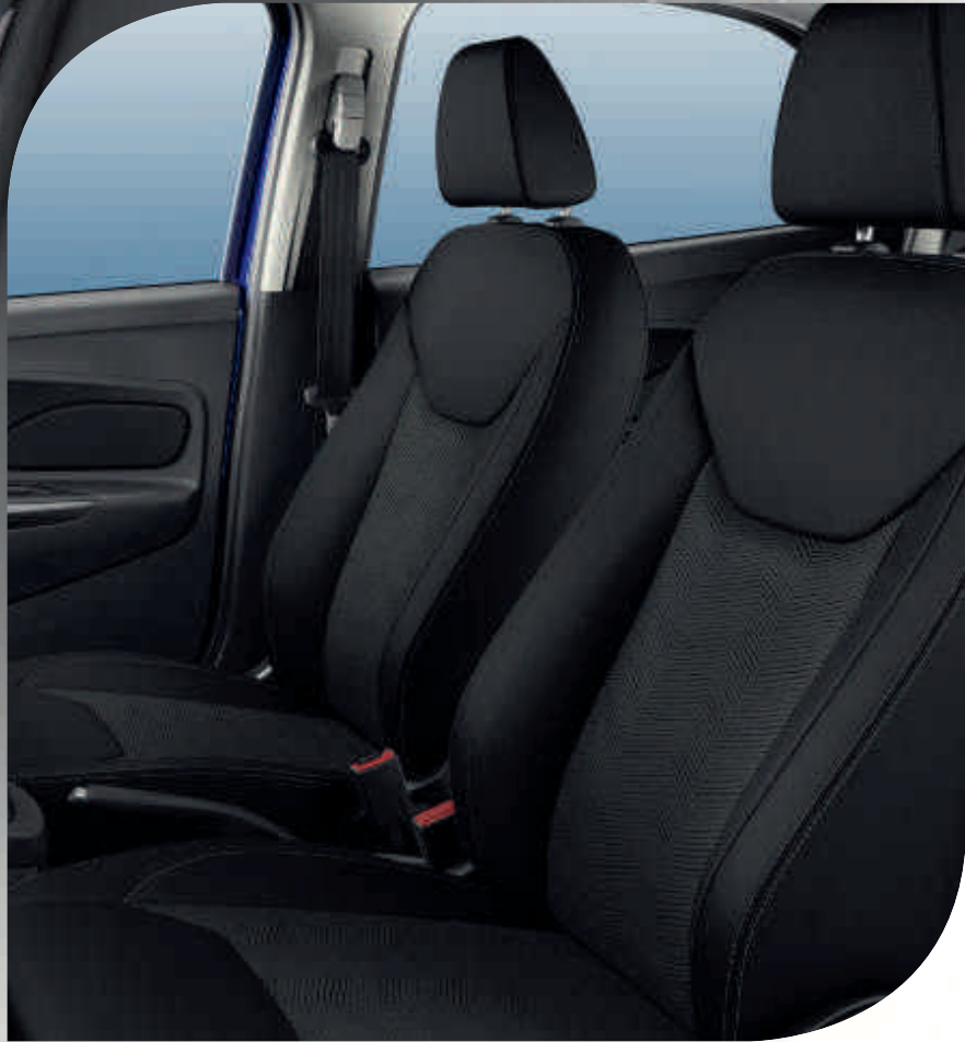
Seat insert: Lodha in Dark Shadow Seat bolster: Vigo in Charcoal Black Stitching: Fog Grey

Get a little closer to this trim with the Ford KA+ Interactive Brochure. Simply download the Ford Interactive Brochure App from Google Play or the App Store.