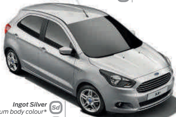
Ingot Silver Sd Premium body colour* Zt