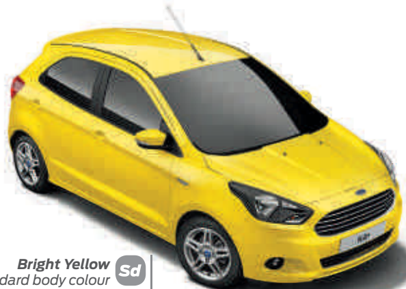
Bright Yellow Sd Standard body colour Zt