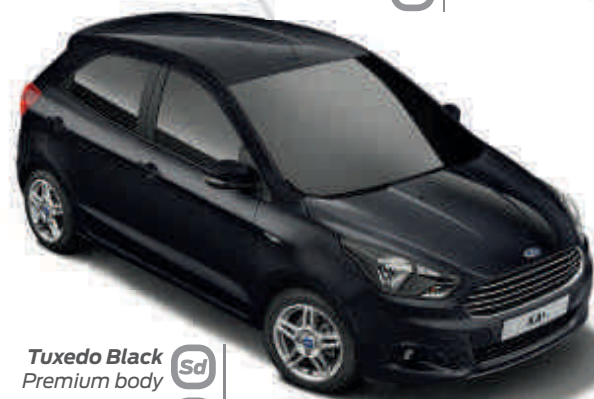
Tuxedo Black Sd Premium body colour* Zt