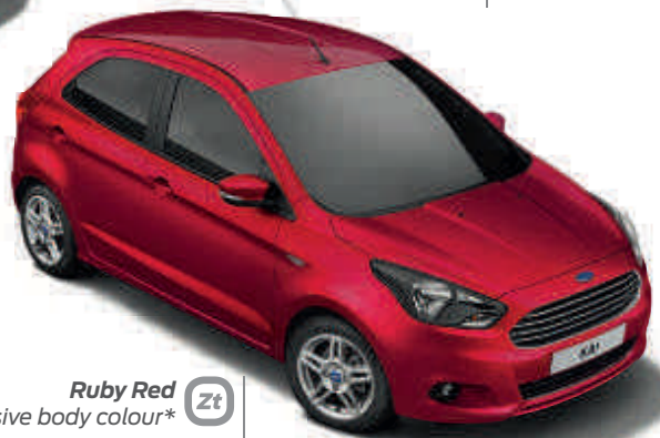
Ruby Red Zt Exclusive body colour*

You can change KA+ colours instantly on the configurator