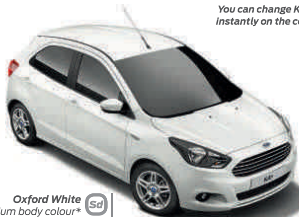
Oxford White Sd Premium body colour* Zt