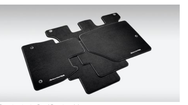
Carpet mat set – 5 and 7 seat models