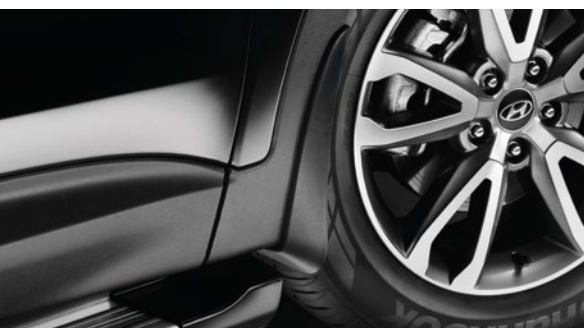
Mud flan se