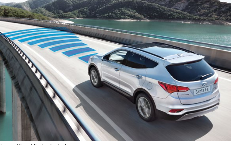
Advanced Smart Cruise Control

Available on Premium SE automatic model, the convenience pack includes Advanced Smart Cruise Control for an even easier drive and Around View Monitor for more awareness when parking. The Autonomous Emergency Braking will alert you if people or vehicles are too close and brake autonomously if it needs to — taking care of you and your passengers on each trip.