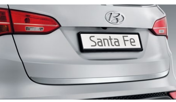
Tailgate trim – chrome