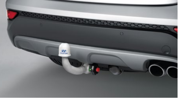
Towbar – fixed and detachable Image shown is Detachable Towbar. Wiring kit also required.