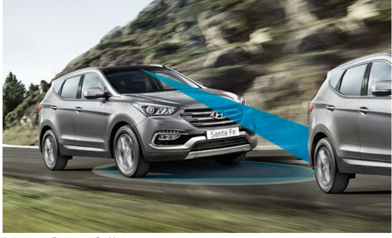
Autonomous Emergency Braking

COLOURS & CONVENIENCE PACK HYUNDAI SANTA FE