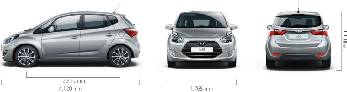
Wheels shown not to UK specification.