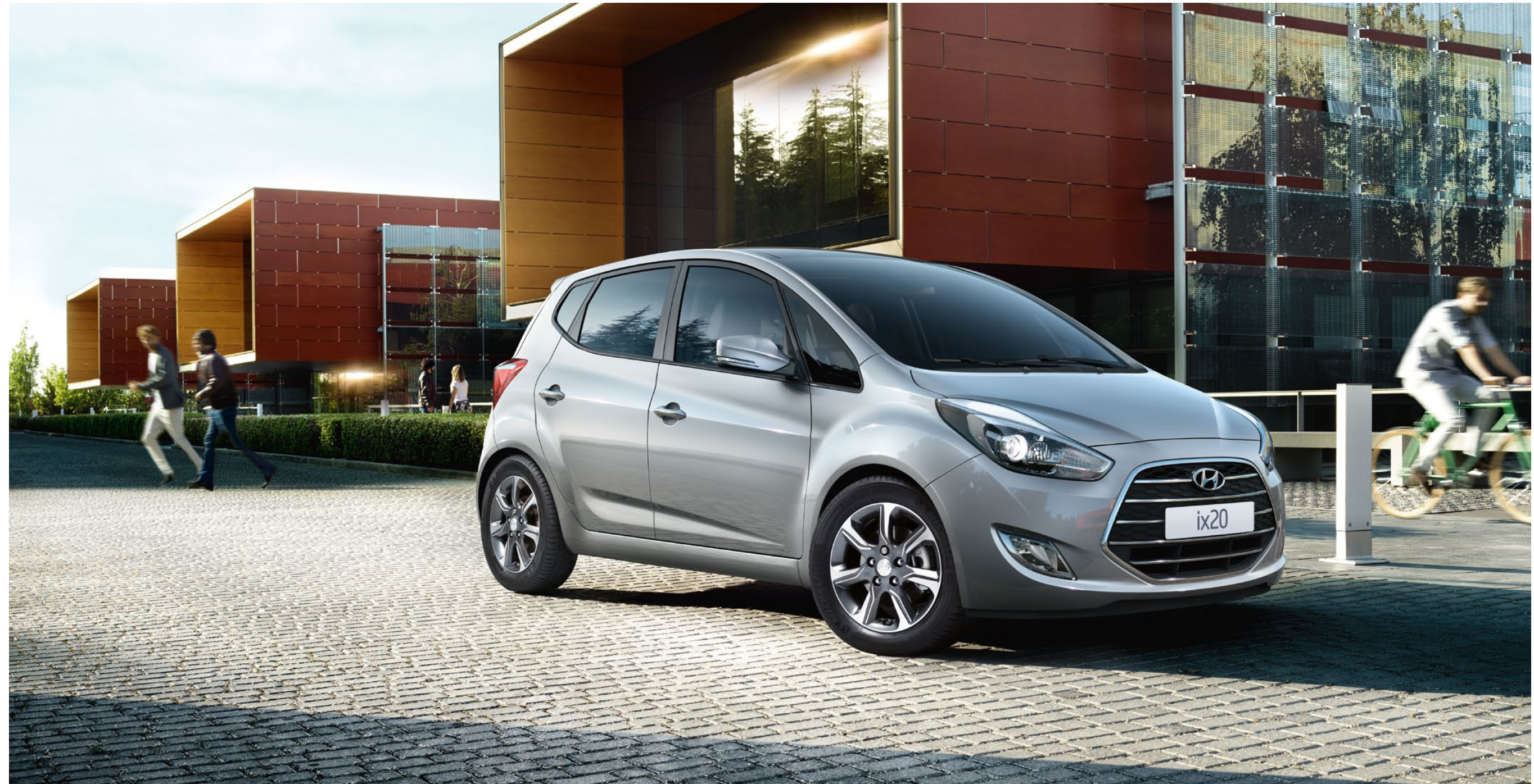
Car shown ix20 Premium in Platinum Silver metallic paint. Headlights shown not to UK specification.

The ix20 doesn't do boxy. Its dynamic design, spacious interior and efficient drive are enhanced by all the clever little extras inside. It's the stand-out car in its class.