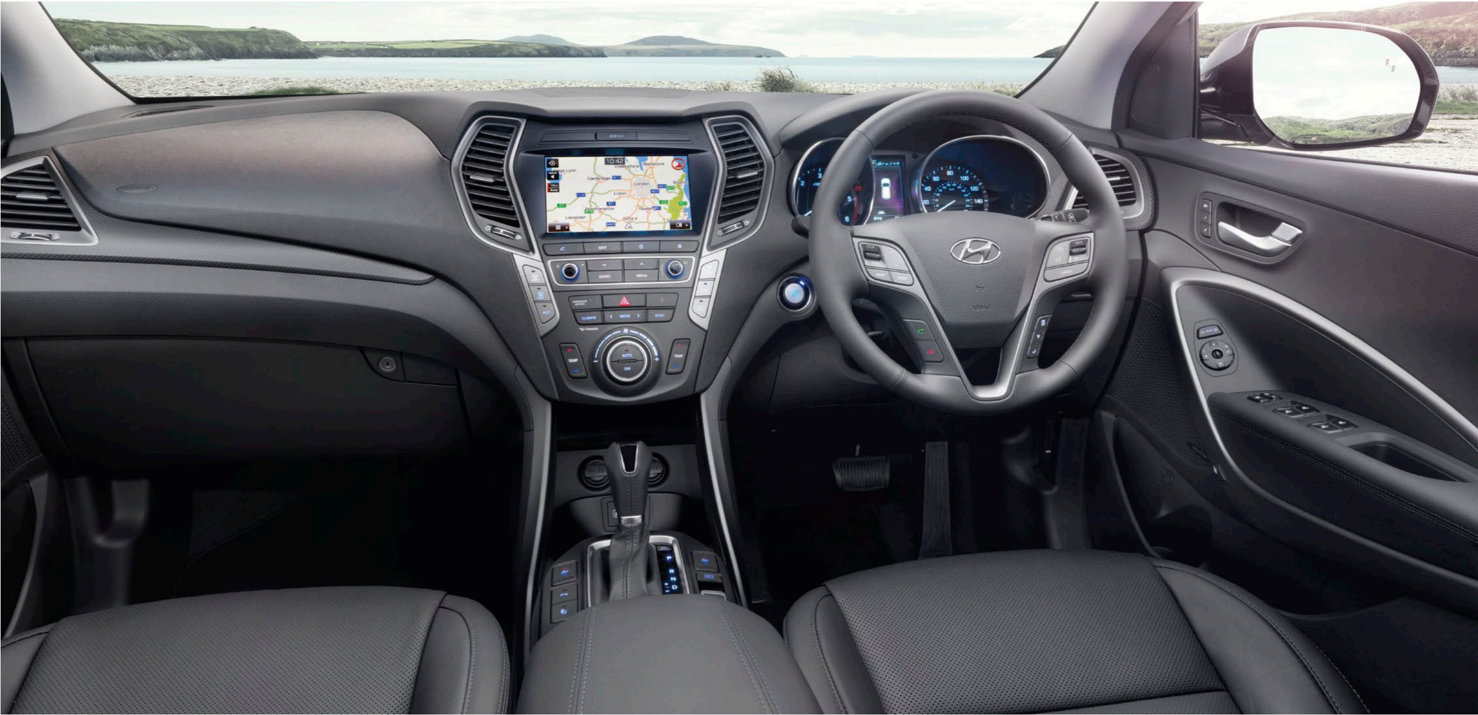
Car shown Santa Fe Premium SE.

Intricate stitching gives the seats a more personal feel and each surface carries the hallmark of quality. This becomes obvious whether you're touching the stylish leather steering wheel or glancing over the chrome effect interior door handles. The leather seats in the front and rear are heated to guarantee comfort during the winter, while ventilated front seats on Premium SE will help you to stay cool on sunny days. You'll find your perfect driving position using the electric driver's seat lumbar support and height and reach adjustable steering column which both come as standard. Climate control will help you maintain the optimum temperature and a supervision cluster with LCD display on Premium SE models gives you all the information you need.