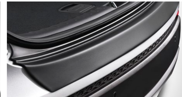
Rear bumper protector – moulded