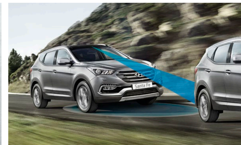
Autonomous Emergency Braking