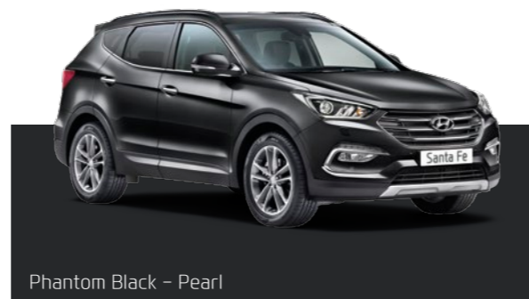
Phantom Black – Pearl