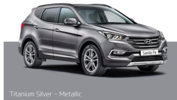
Titanium Silver – Metallic