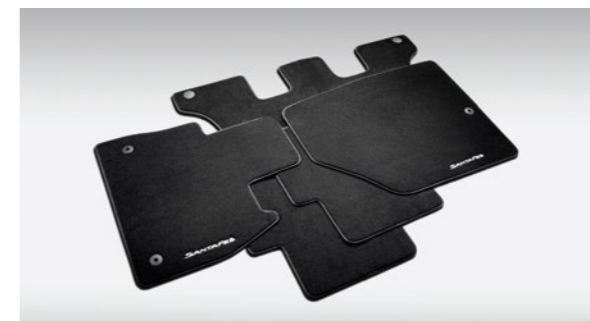
Carpet mat set – 5 and 7 seat models