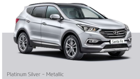
Platinum Silver – Metallic