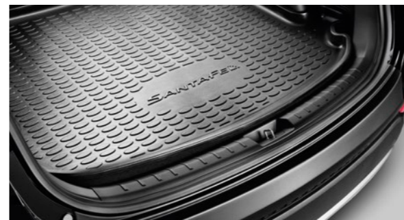
Boot liner – 5 and 7 seat models