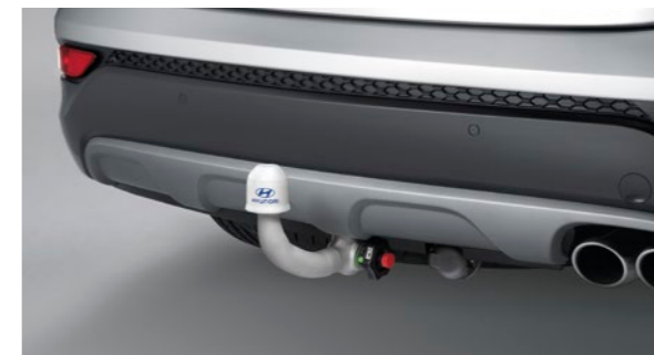
Towbar – fixed and detachable Image shown is Detachable Towbar. Wiring kit also required.