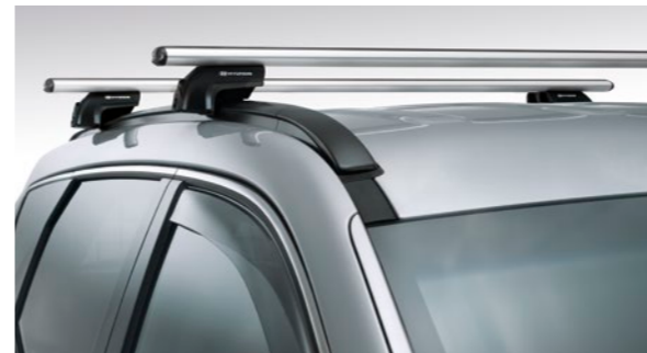
Cross bars – aluminium