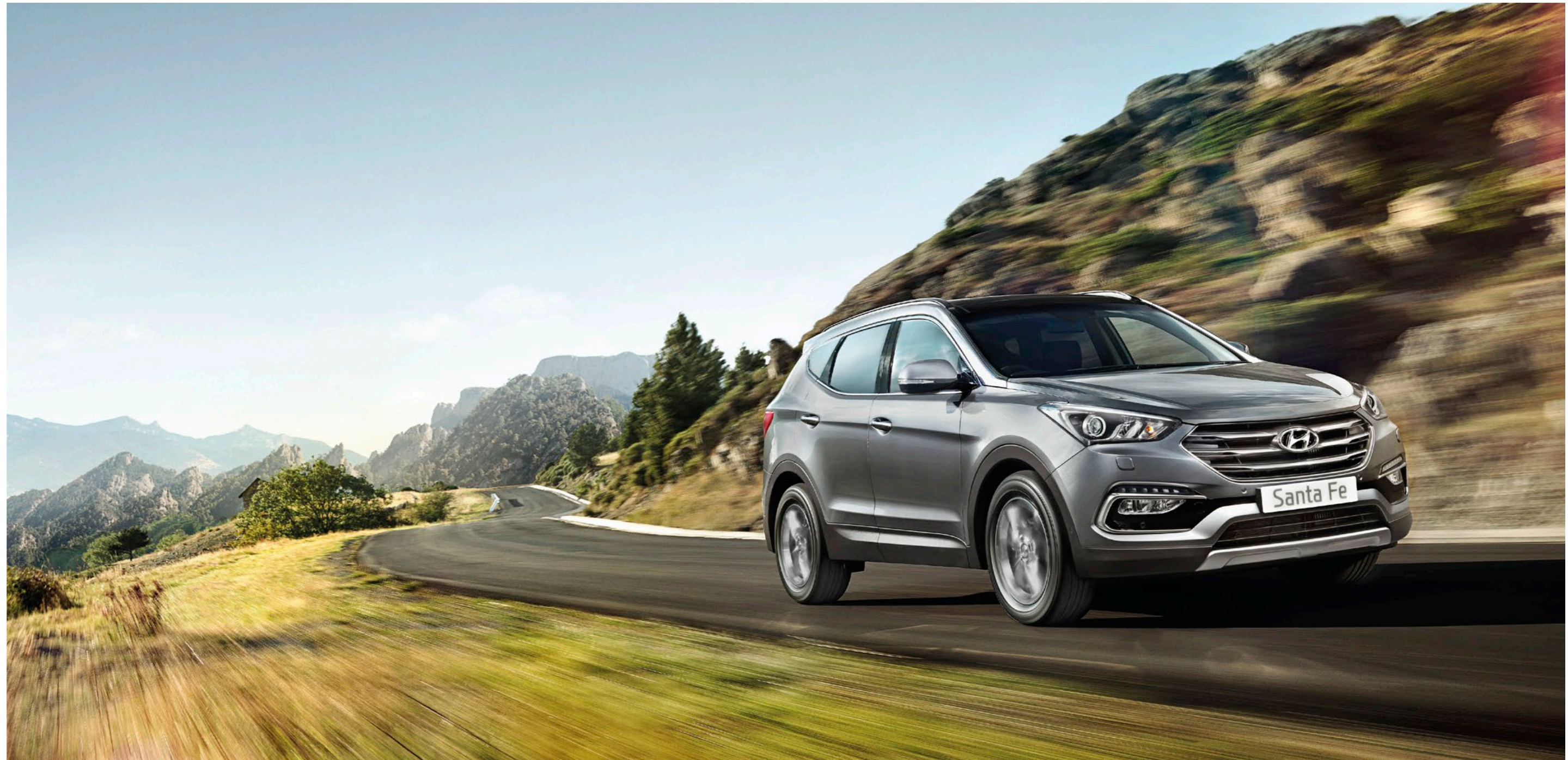
Car shown Santa Fe Premium SE in Titanium Silver metallic paint.

Confident, imposing and extremely well-appointed, Santa Fe combines first class comfort with a powerful engine and cutting-edge technology. It excels on every surface, so take the adventurous route and enjoy premium luxury all the way.