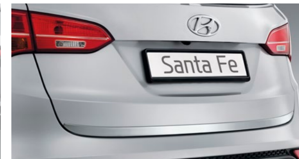
Tailgate trim – chrome