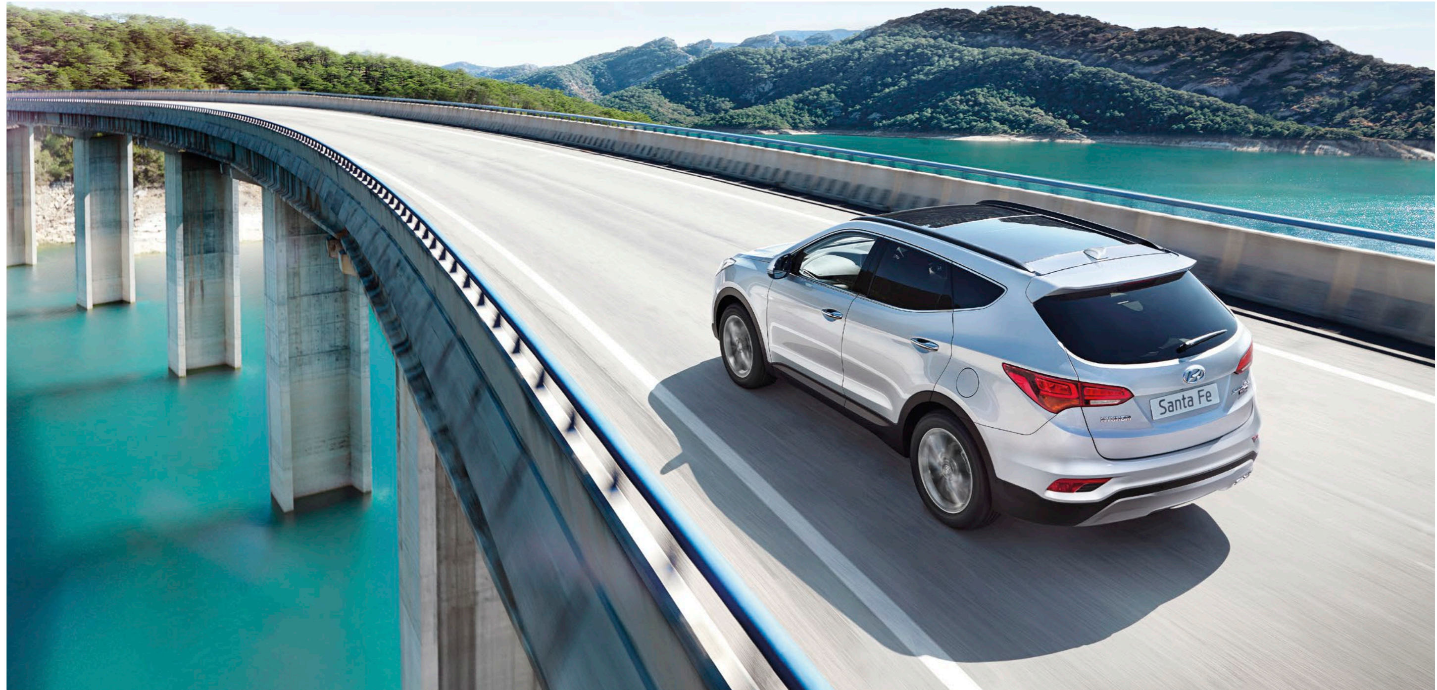
Car shown Santa Fe Premium SE in Platinum Silver metallic paint.

It comes with 6-speed manual or 6-speed automatic transmission to give you total flexibility. Sound-insulating film in the windscreen and thicker front door glass means that wind and road noise has been significantly reduced. And it produces plenty of power thanks to its 2.2 CRDi 200PS engine which delivers 440Nm torque, resulting in a maximum braked towing weight of 2,500kg on manual models. The Torque on Demand 4WD system ensures that, unlike some 4WD systems, it only applies the drive to all four wheels when needed, helping it deliver up to 47.1 MPG on a combined cycle, with CO 2 emissions starting at 159g/km.