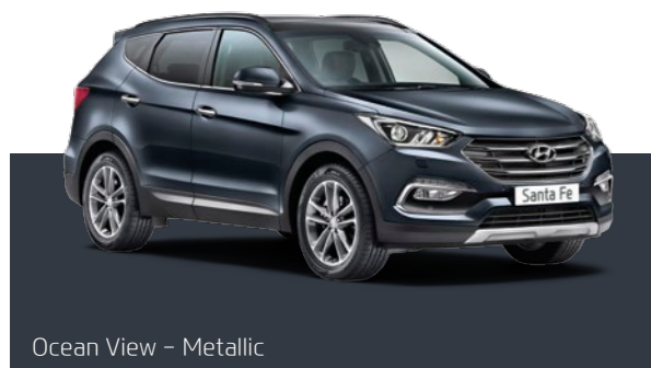
Ocean View – Metallic