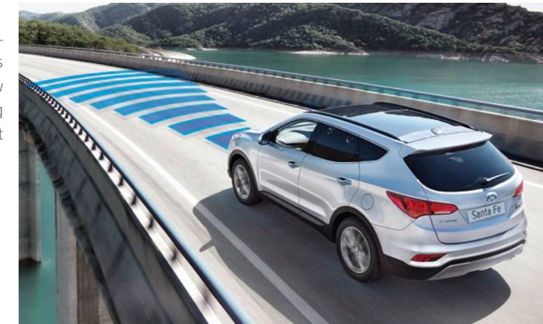
Advanced Smart Cruise Control

Available on Premium SE automatic model, the convenience pack includes Advanced Smart Cruise Control for an even easier drive and Around View Monitor for more awareness when parking. The Autonomous Emergency Braking will alert you if people or vehicles are too close and brake autonomously if it needs to — taking care of you and your passengers on each trip.