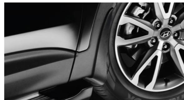
Mud flap set