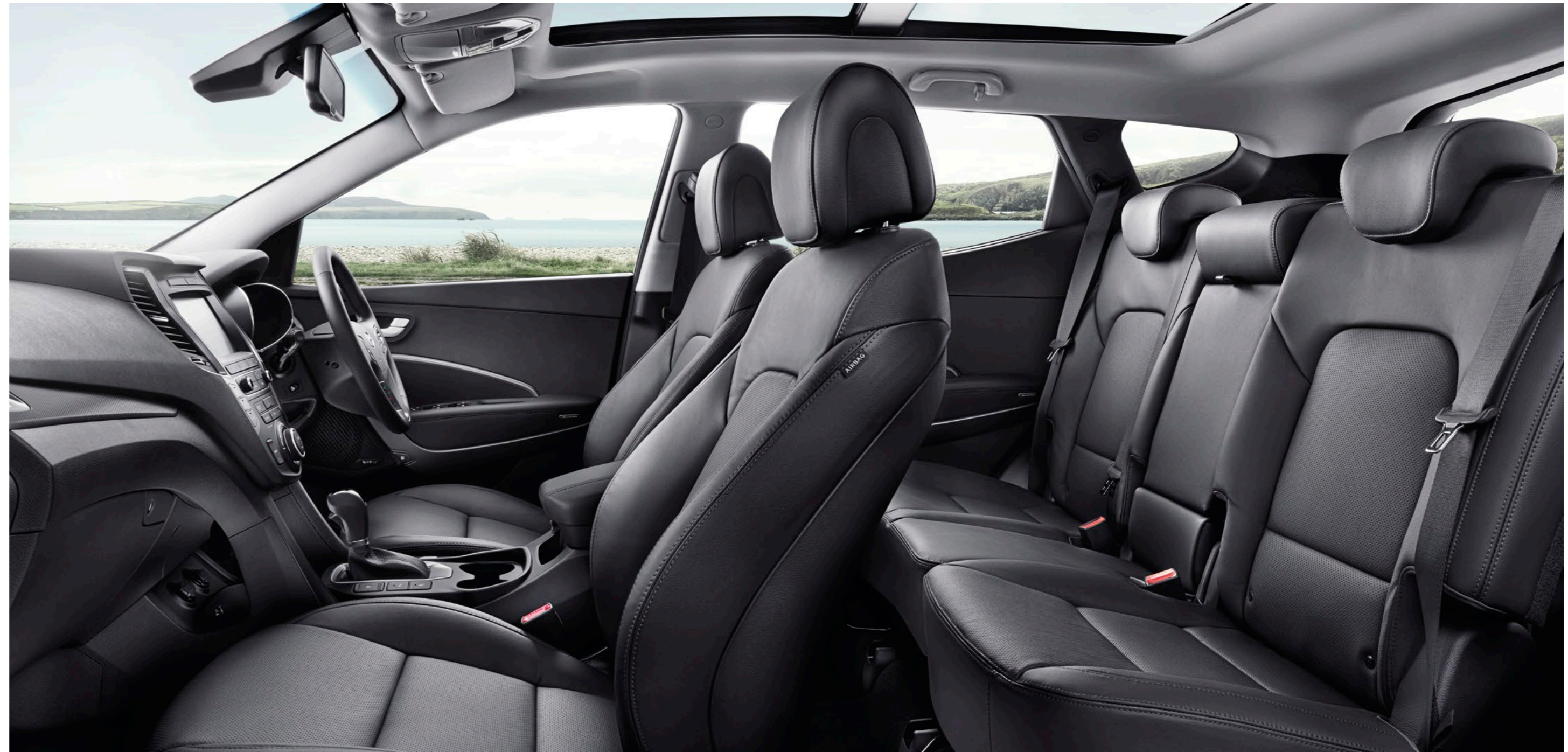
Car shown Santa Fe Premium SE.

There's an abundance of head, leg and shoulder room for every passenger, while a panoramic sunroof on the Premium SE will flood the cabin with light. When it comes to the seating arrangements there is no strict setup. Instead, it's down to you to make all the adjustments — you can even configure the seats to achieve a significant 1,680 litres of space on 5 seat models and 1,615 litres of space on the 7 seat option. More versatility is provided by the 40:20:40 split rear seats. Plus, on the 7 seat model, there are clever sliding and reclining 2 nd row seats, while the 3 rd row seats fold flat into the boot floor. A luggage net and hooks help you keep everything secure and 7 seat models also bring you the added benefit of rear air conditioning.