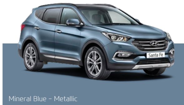
Mineral Blue – Metallic