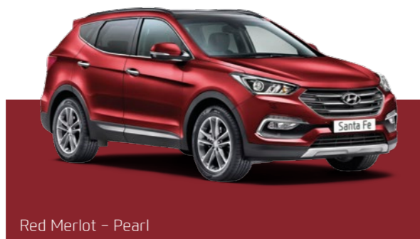
Red Merlot – Pearl