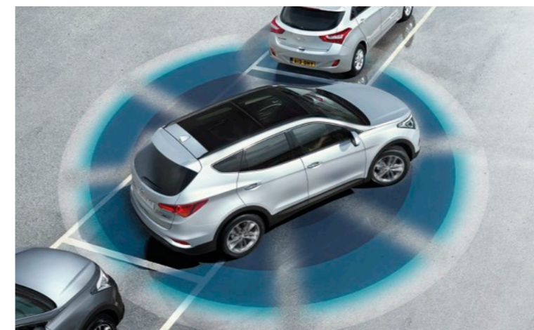
Around View Monitor