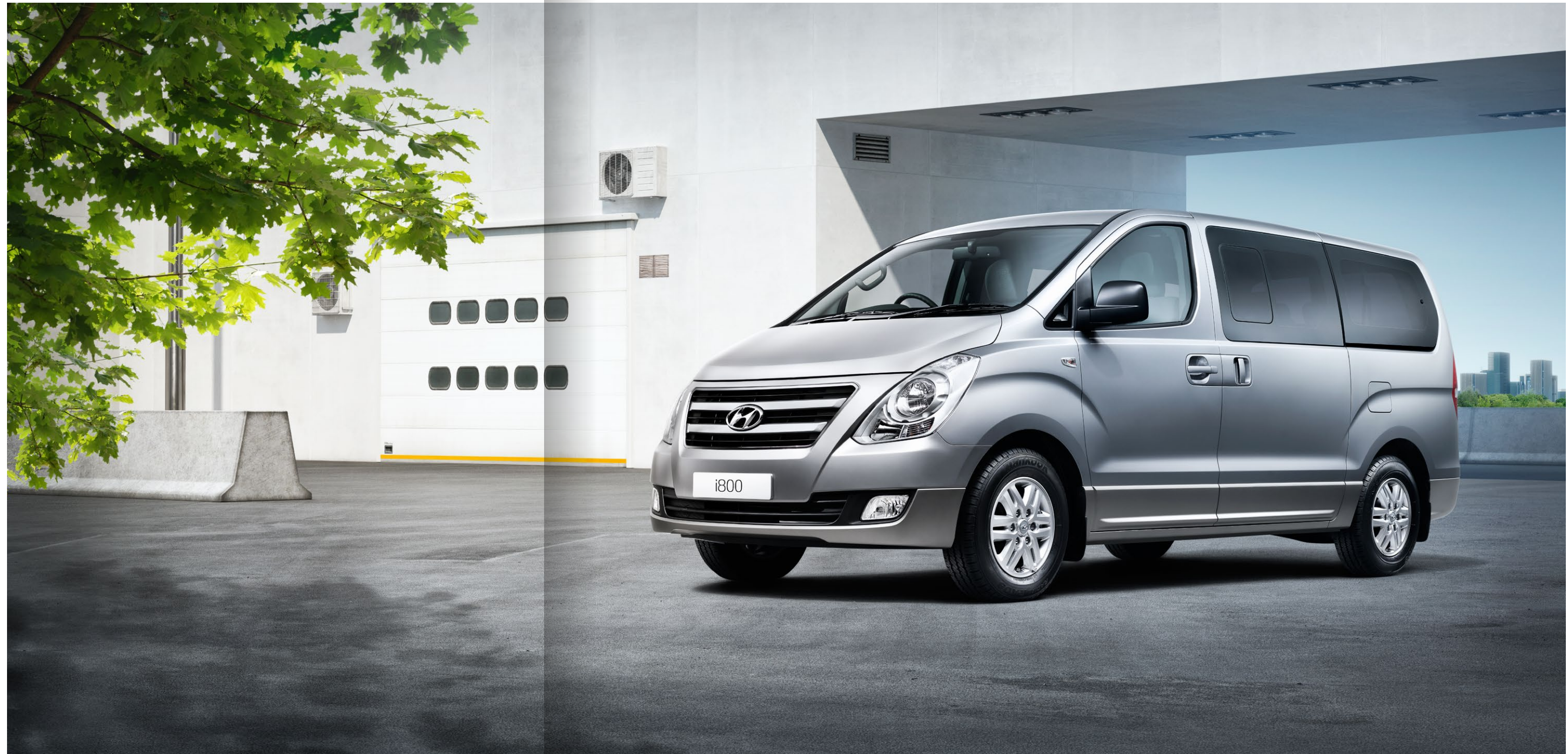
Car shown i800 SE in Hyper Silver metallic paint.

The i800 stands apart due to its smart design – unlike most other cars in its class it comes with eight seats rather than seven, so there's always plenty of room for passengers and luggage. The sliding doors allow easy access for passengers, while useful mud flaps keep the bodywork nice and clean. The 2.5 CRDi engine delivers two power outputs – either 136PS or 170PS — so you'll have all the performance you need. There are also manual and automatic transmission options too. We've incorporated Electronic Stability Programme (ESP), Anti-lock Braking System (ABS), Electronic Brake force Distribution (EBD) and Traction Control System (TCS), so you'll enjoy a safe journey. And when you come to a stop, you'll take advantage of the rear parking sensors to guide you into the tightest gaps. It's a versatile vehicle that's perfect for every occasion.