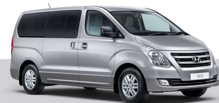
Hyper Silver – Metallic