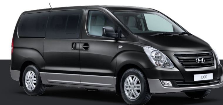
Timeless Black – Pearl