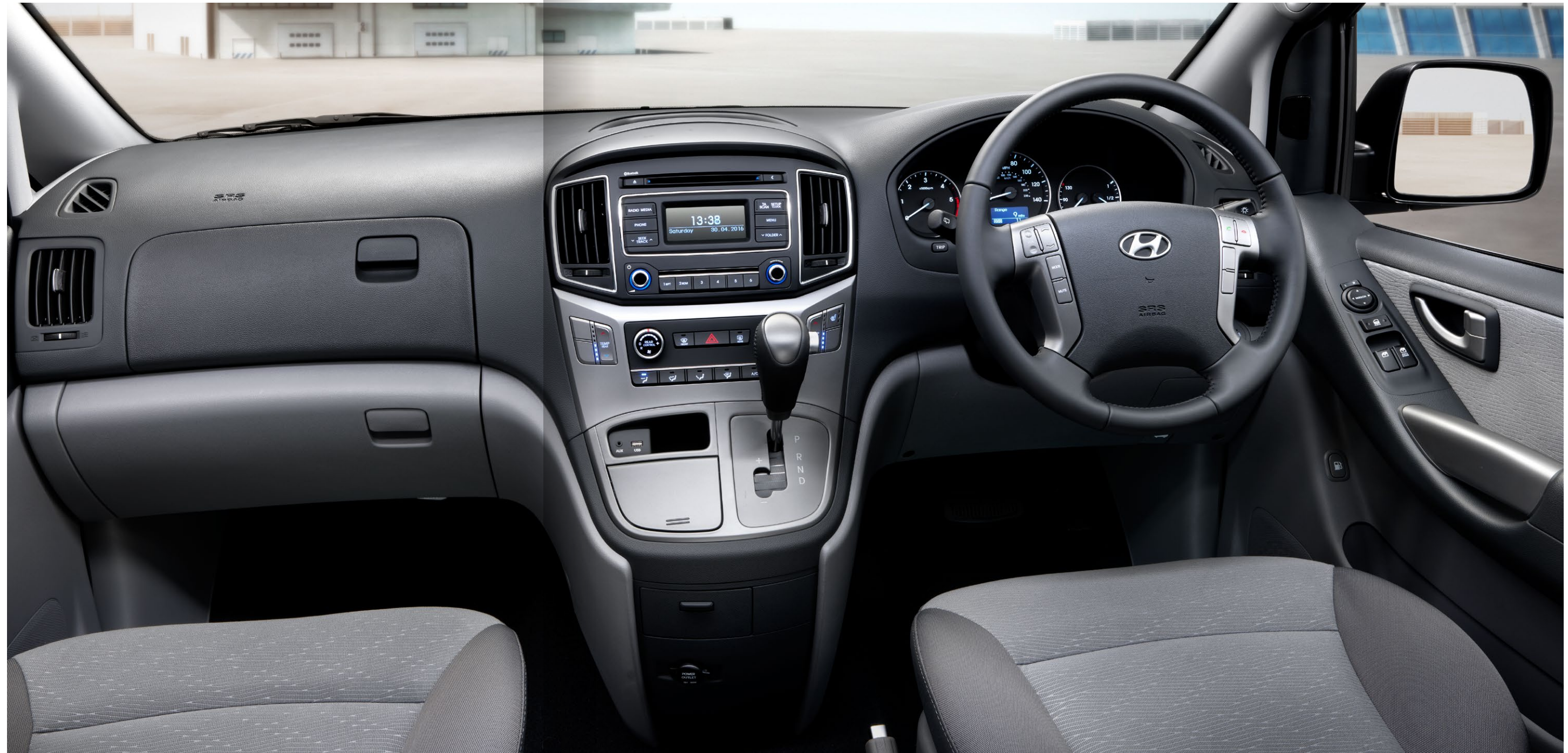
Car shown i800 SE with automatic transmission.

The i800 takes good care of its passengers, but it's just as comfortable in the driver's seat. The elevated driving position gives you excellent visibility, and the seat is also heated and fully adjustable, enabling you to find the right position. The second row slides and reclines, while the third row also reclines. It'll enable your passengers to find the perfect position with generous leg, head and shoulder room. The second row of passengers will also be able to alter the air conditioning settings so they can find the ideal temperature. If there are fewer passengers in the car, you'll still be able to put the space to good use. Both the second and third row of seats split 60/40 for extra storage — perfect for trips to a DIY store or garden centre. With an adaptable layout and the added boost of Bluetooth® connectivity to keep you entertained, it's one of the leading cars in its class.