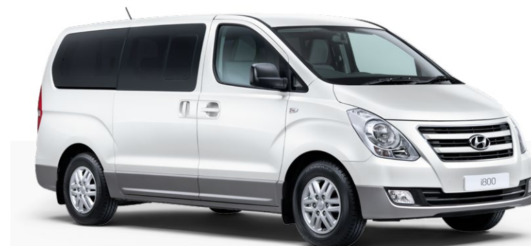
Creamy White – Solid