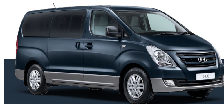
Ocean View – Metallic