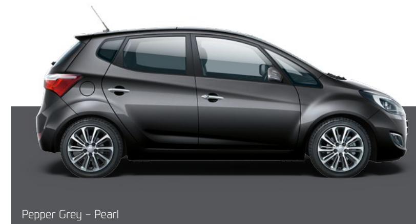
Pepper Grey – Pearl