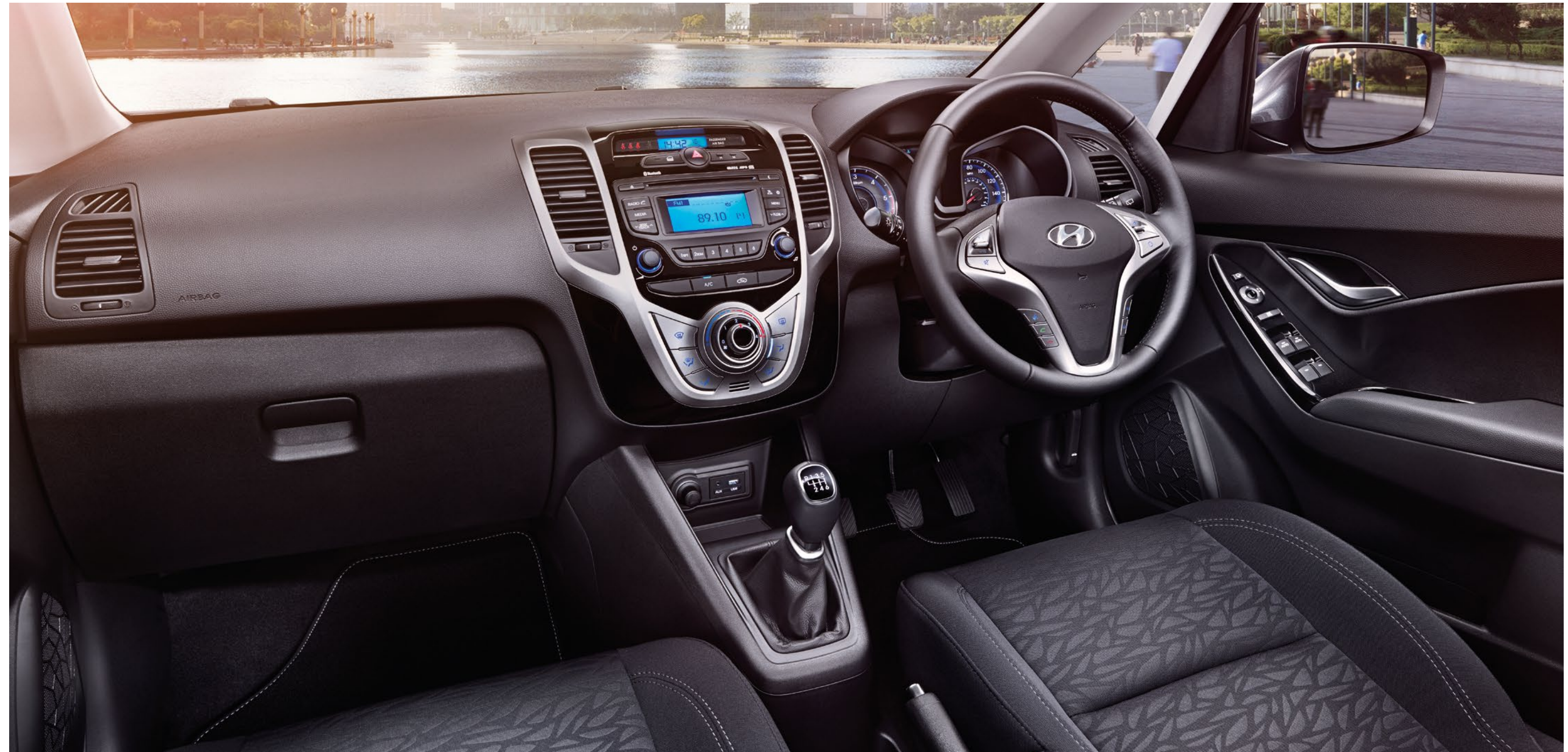
Car shown ix20 SE.

You'll quickly notice the cool blue illumination of the instrument panel, while the soft touch feel of the dashboard adds to the smart ergonomics and quality design. Once you're sitting comfortably you'll be able to find the perfect temperature thanks to air conditioning. USB and aux connections allow you to plug in your compatible phone or MP3 player and listen to all your favourite songs. Enjoy a range of impressive features as standard, including Bluetooth® connectivity with voice recognition. Steering wheel audio controls also mean you can keep your ears trained on the music, and your eyes focused on the road ahead. On SE Nav and Premium Nav models, arrive with ease using Touchscreen Satellite Navigation which feeds back real-time traffic information. And when you finish your journey, the rear view camera will help you to fit into the tightest of gaps.