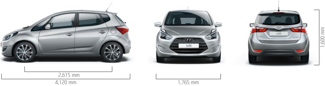
Wheels shown not to UK specification.