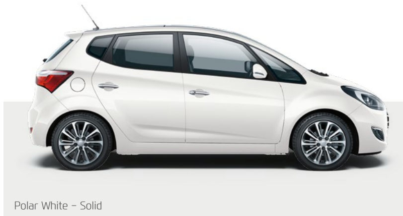
Polar White – Solid