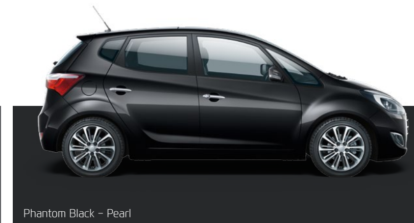
Phantom Black – Pearl