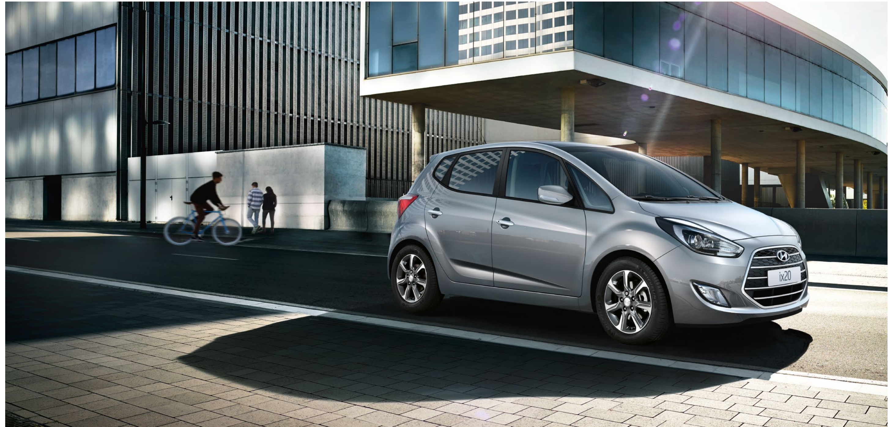
Car shown ix20 Premium Nav in Platinum Silver metallic paint. Headlights shown not to UK specification.

The ix20 manual models include Intelligent Stop and Go (ISG), which automatically stops the engine when you come to a halt, and restarts it again when you de-press the clutch. It also has low rolling resistance tyres and electric power assisted steering, which is quieter, lighter and saves energy – ultimately reducing emissions. As well as the 1.6 diesel Blue Drive, you can opt for a 1.6 petrol automatic or a 1.4 petrol manual. If you select manual transmission you'll also benefit from an eco-drive indicator which suggests the optimum time to change gear for maximum efficiency. It's our way of giving you more influence over your fuel consumption. With a range of high-tech engines optimised for greater economy, the ix20 is a perfect example of our fuel-saving philosophy.