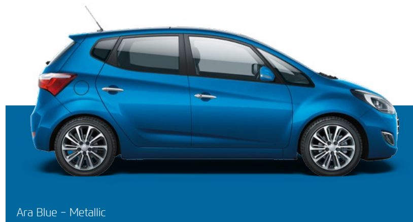
Ara Blue – Metallic