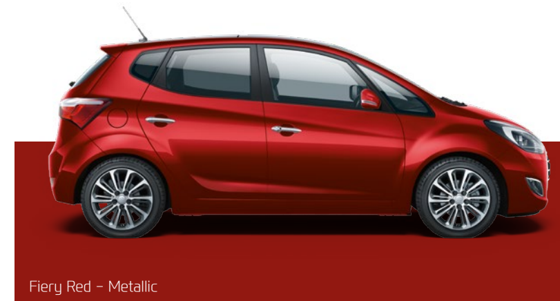
Fiery Red – Metallic