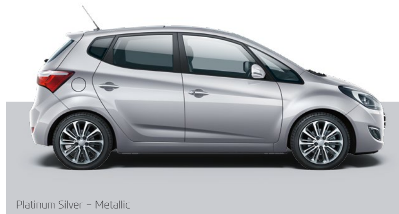
Platinum Silver – Metallic