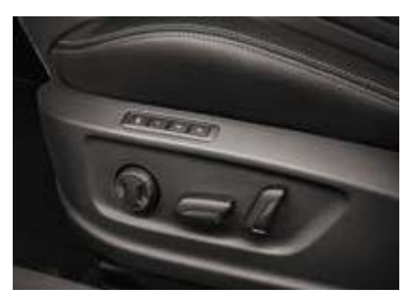
ELECTRICALLY ADJUSTABLE FRONT SEATS WITH MEMORY FUNCTION