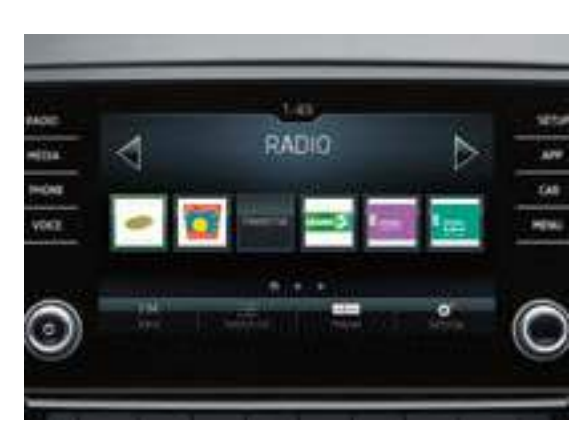
BOLERO RADIO WITH 8" TOUCHSCREEN DISPLAY