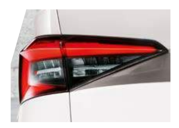
REAR LED LIGHTS (HIGH FUNCTIONALITY)

With an impressive amount of standard equipment, the KODIAQ SE L is the perfect blend of practicality and specification.