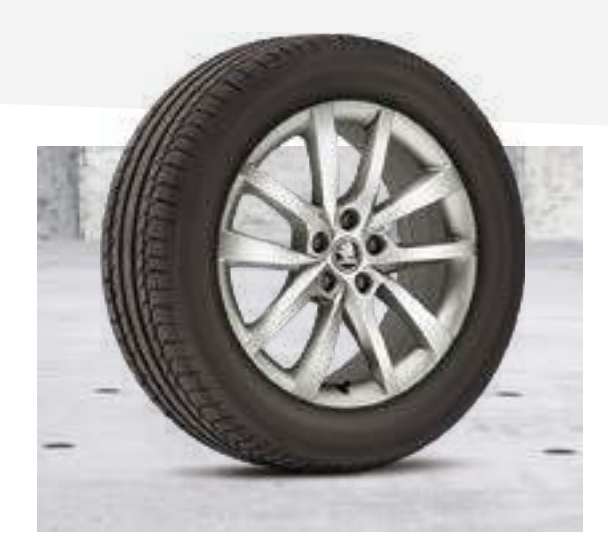
BLACK FABRIC INTERIOR 18" ELBRUS ALLOY WHEELS