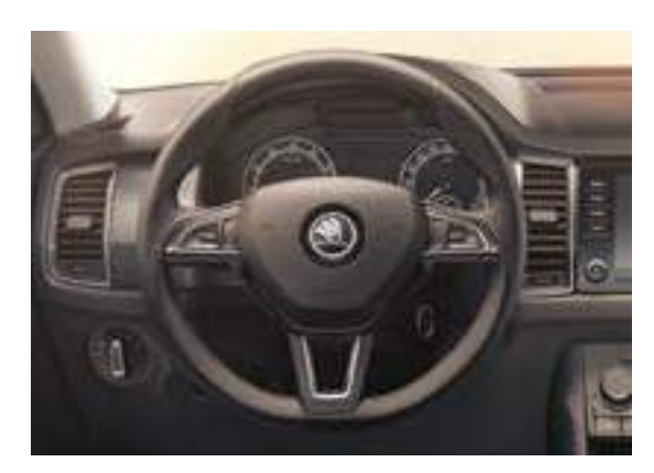
3-SPOKE LEATHER MULTI-FUNCTION STEERING WHEEL