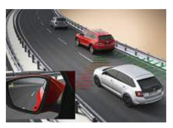
BLIND SPOT DETECTION