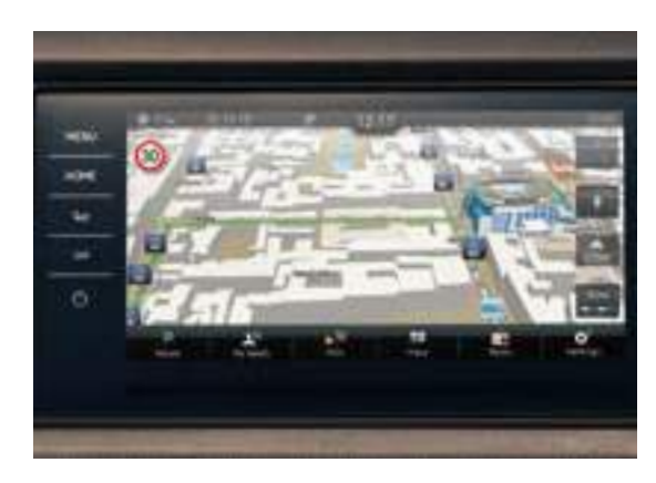
COLUMBUS SATELLITE NAVIGATION WITH 9.2" TOUCHSCREEN DISPLAY AND INTEGRATED WI-FI