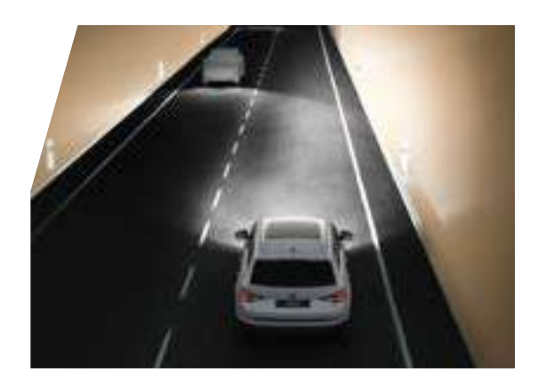
LIGHT ASSIST WITH HIGH BEAM CONTROL

To celebrate the arrival of our first five and seven-seater, the Edition features an extensive range of connected and assist systems fit for any adventure.