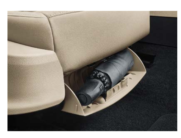
UMBRELLA UNDER PASSENGER SEAT