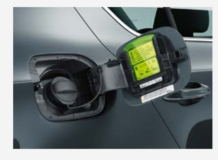
FUEL DOOR With fuel-fill protection, you'll never load up with the wrong fuel again. You'll also find a handy ice scraper on the fuel door for those frosty mornings.