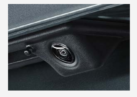
Located on the boot handle, the rearview camera makes light work of reverse parking, with an integrated washer to keep obstacles visible.