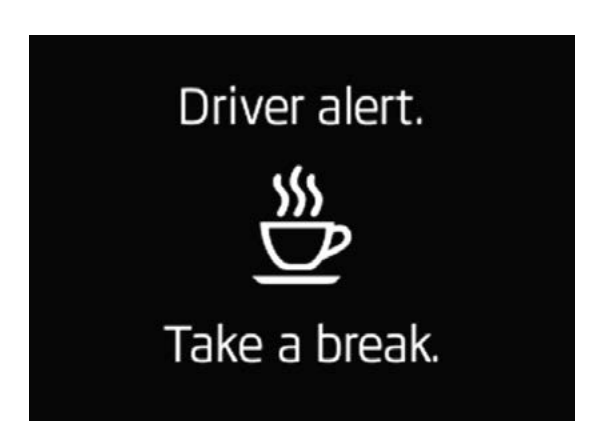
DRIVER FATIGUE SENSOR