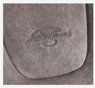
EMBROIDERED LOGO ON SEAT BACKRESTS