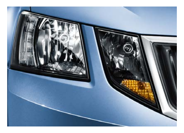
HALOGEN HEADLIGHTS WITH LED DAYTIME-RUNNING LIGHTS