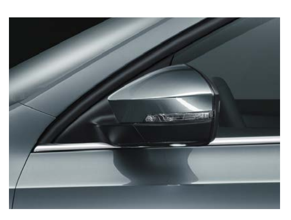
BODY COLOURED DOOR MIRRORS AND HANDLES