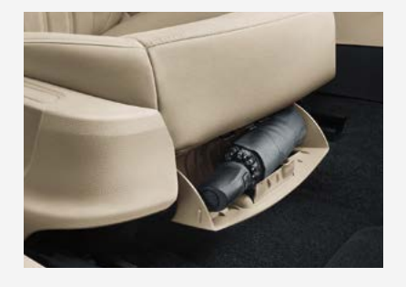
UMBRELLA STORAGE A spot of rain will never dampen your spirits again thanks to the umbrella located under the passengers seat.