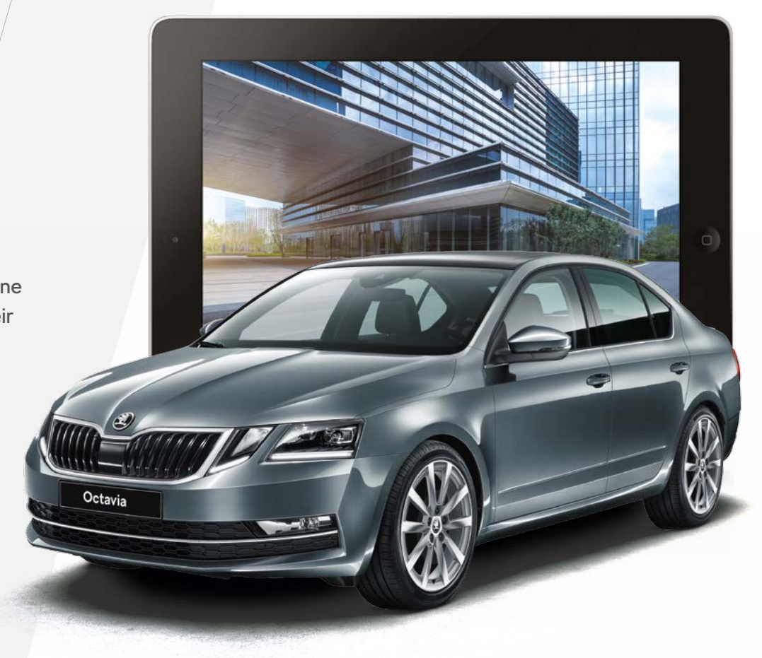
COLOUR TRIM TECH SEATS WHEELS SOUTH STATE OF THE SEATS WHEELS

For full technical specifications and pricing, speak to your local ŠKODA Retailer.