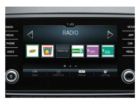
BOLERO RADIO WITH 8" TOUCHSCREEN DISPLAY