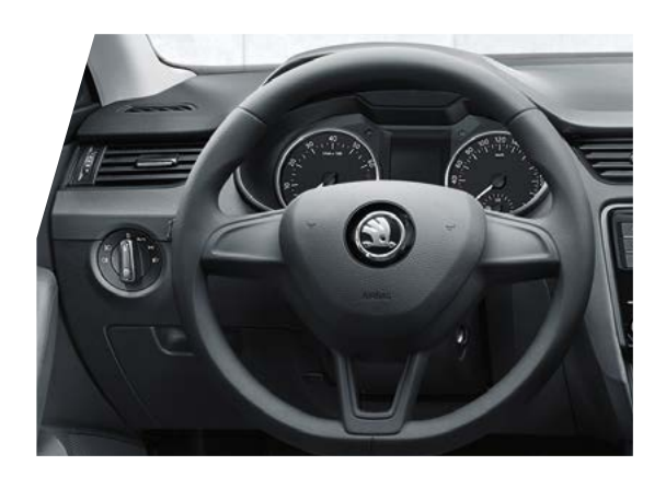
3-SPOKE LEATHER STEERING WHEEL

Anything but standard, this entry-level trim is packed with features and thoughtful touches.