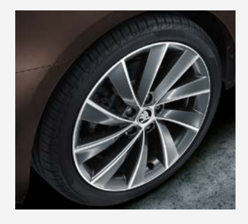
18" TURBINE ALLOY WHEELS