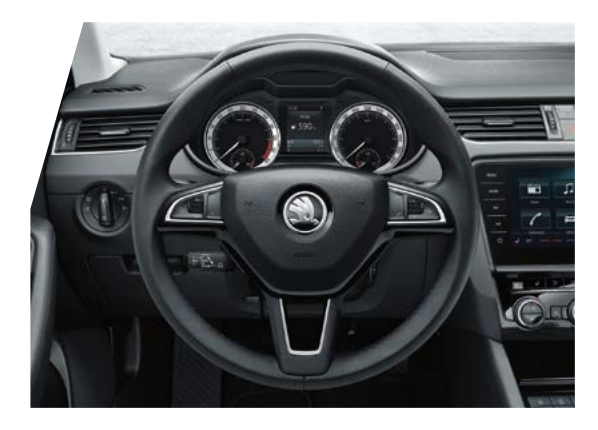
3-SPOKE LEATHER MULTIFUNCTION STEERING WHEEL

Featuring impressive comfort enhancing features and intuitive driver assist systems, the SE adds further distinction to the car.