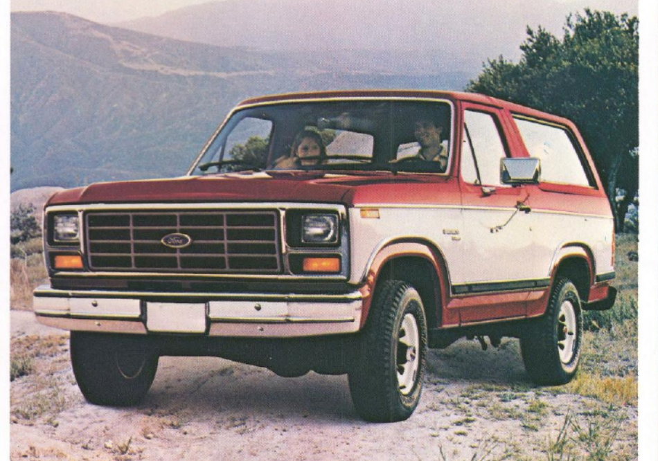
Bronco XLT Lariat.