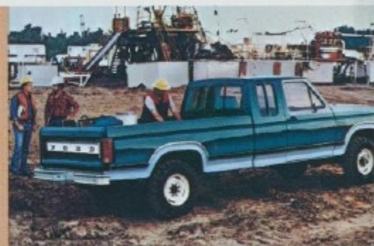
4x4 SuperCab XL

The Ford 4x4 is right for the times. Built to take you on- or off-road in comfort. And wherever you go, you'll go with Ford's advanced technology, aerodynamic design and downright good looks. If your business or your pleasure requires a 4x4, test-drive the '82 Ford. It's the way to go "tough" comfortably.