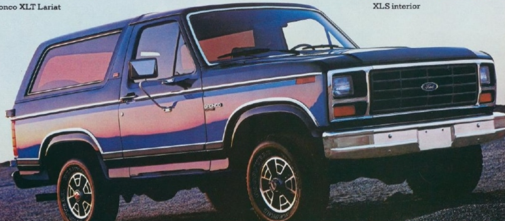
Bronco XLT Lariat