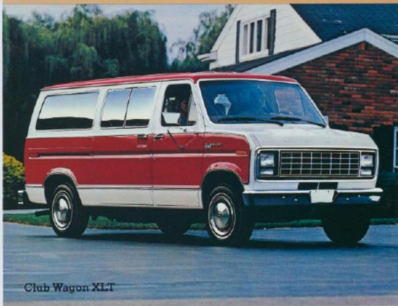
Club Wagon XLT

A versatile vehicle that offers family comfort. The perfect travel/getaway vehicle. Also great for towing applications and van pooling. Club Wagons can seat from four to 12 passengers—up to 15 in Super Wagons! Try out the King of Clubs with dual Captain's Chairs, WSW radial tires, power door locks, automatic transmission, plus much more.