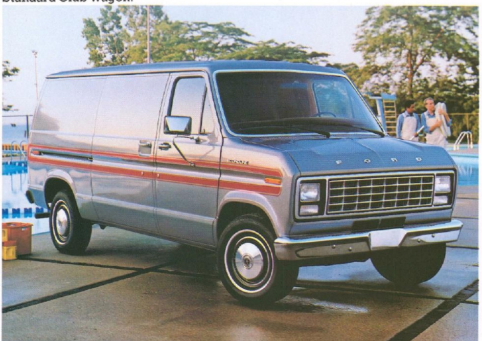
Standard Econoline Van.