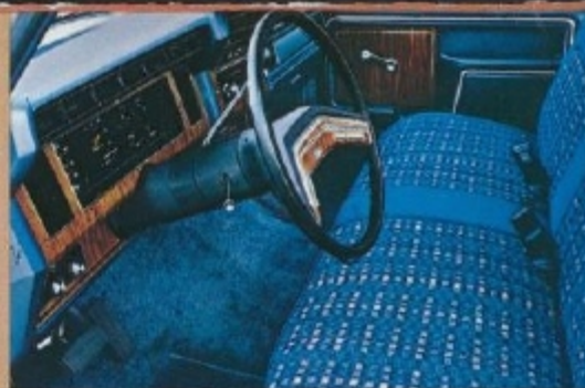
XLT Lariat interior

*See Back Cover for mileage information.