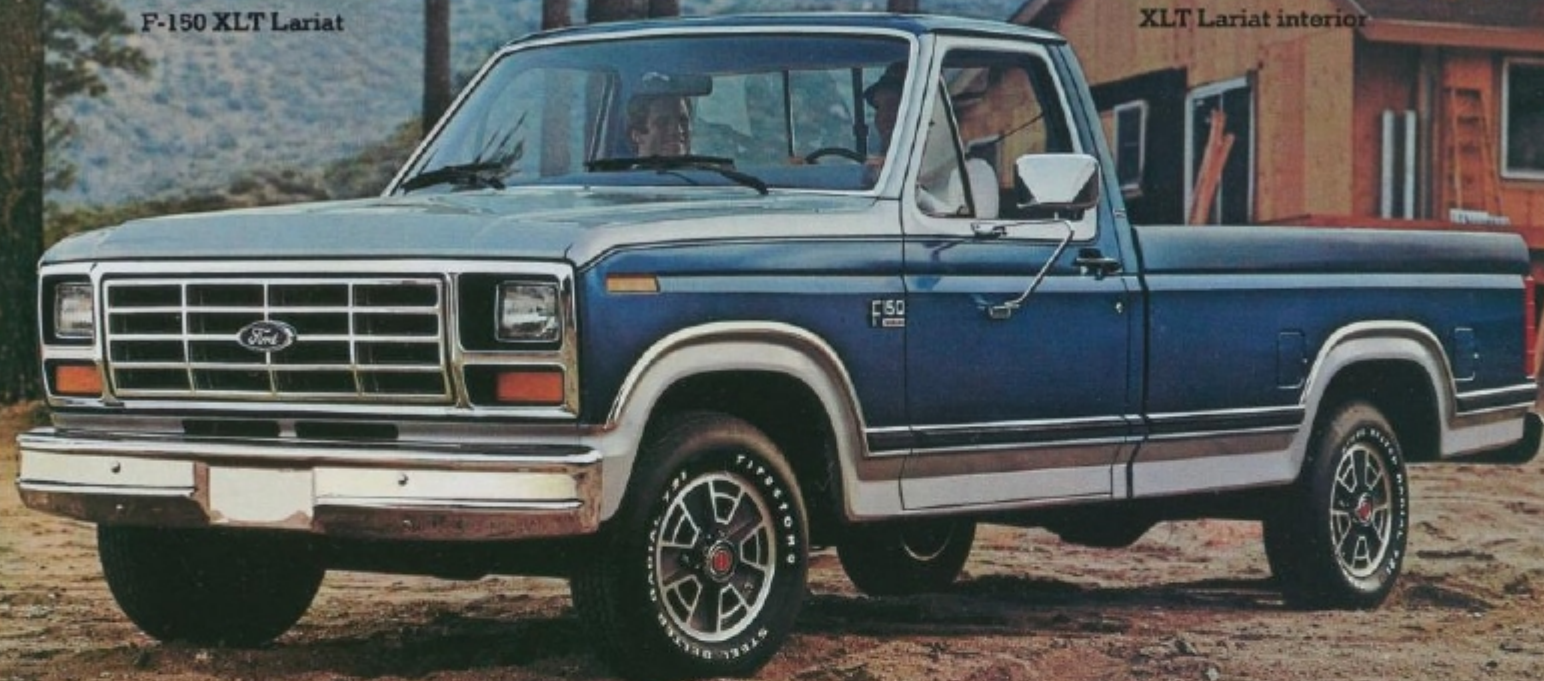
F-150 XLT Lariat