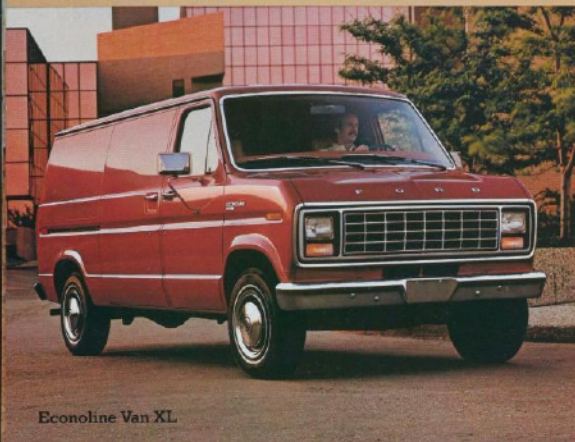
Econoline Van XL

Ford Econolines give you the advantages of Twin-I-Beam front suspension and out-front engine design that provides an outside service center and inside move-around room up front. Choose from cargo vans, display vans, window vans, regular or super vans, all built Ford tough. Millions of people count on Ford Econolines every day. One test drive at your Ford Dealer and you'll see why.