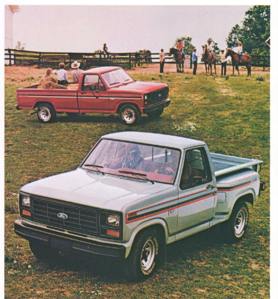
F-150 XLS Styleside and F-150 XLS Flareside.