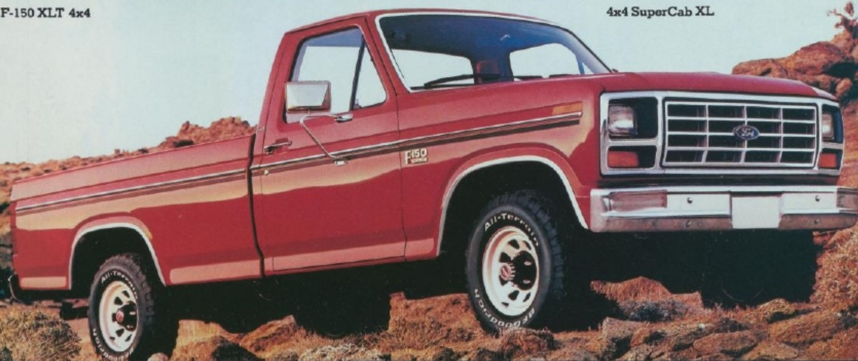
F-150 XLT 4x4