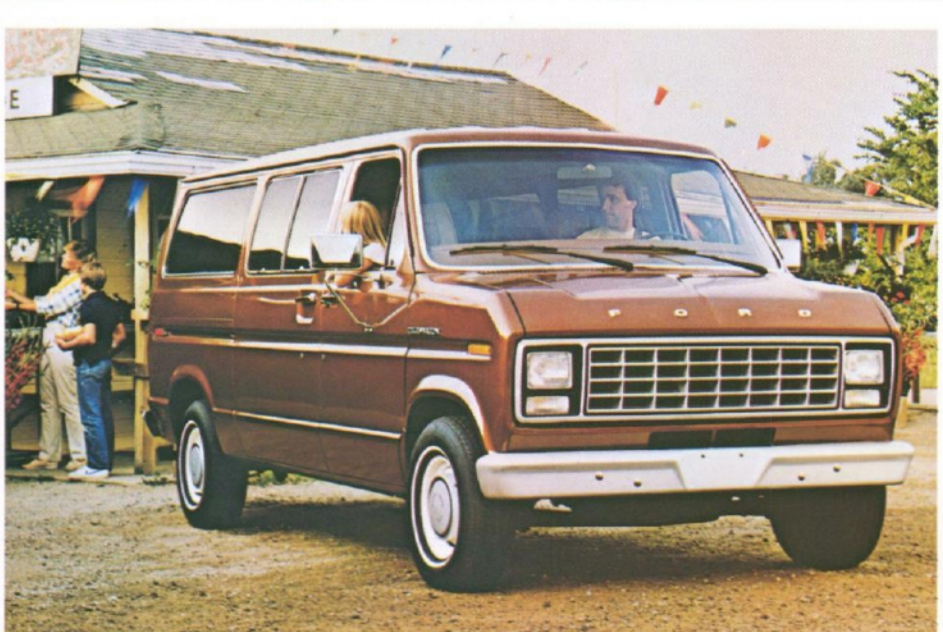
Standard Club Wagon.