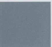
Light Charcoal Metallic 9V B-F