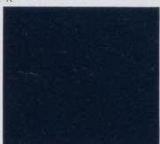
Midnight Blue Metallic 3L B-F-R