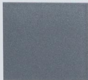
Medium Grey Metallic 1P E-R