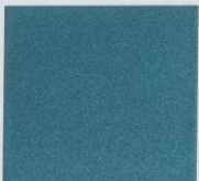
Teal Glow 4W B-F