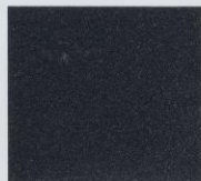
Dark Charcoal Metallic 9W B-F