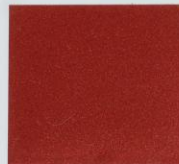
Bittersweet Glow 8G E-R