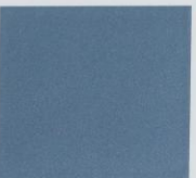
Academy Blue Glow 35 E