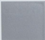
Silver Metallic 1G E-R