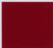
Candyapple Red 2K E-B-F-R