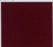
Dark Red Metallic 2S E-B-F