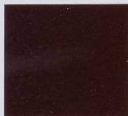
Dark Walnut Metallic 5U E