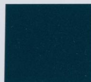
Dark Teal Metallic 4A F