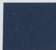
Dark Academy Blue Metallic 5C E