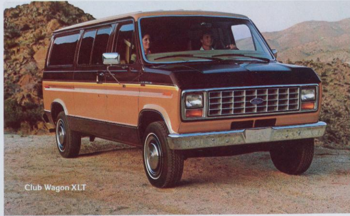
Club Wagon XLT