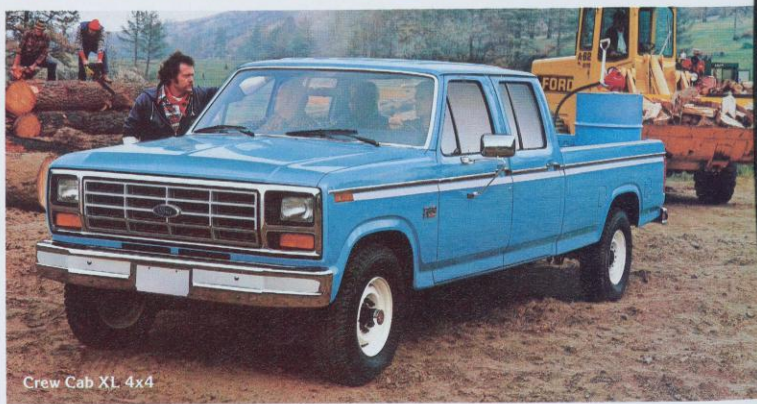
Crew Cab XL 4x4