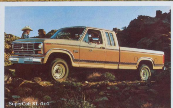
SuperCab XL 4x4