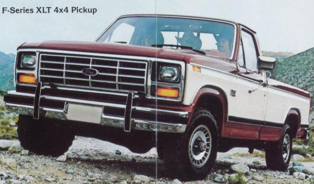
F-Series XLT 4x4 Pickup