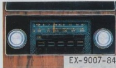
AM/FM Monaural Radio