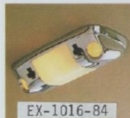
Dual Beam Dome/Map Light (Light Group)