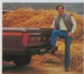
Black Rear Step Bumper EX-1013-84