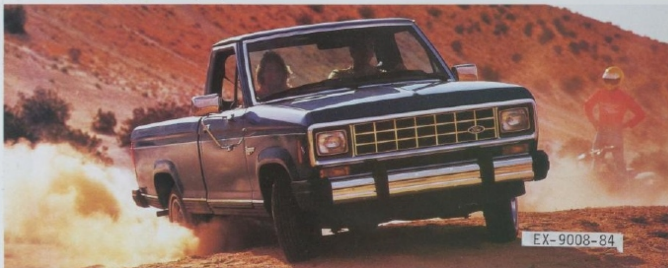
Ford Ranger. Some equipment shown may be optional.