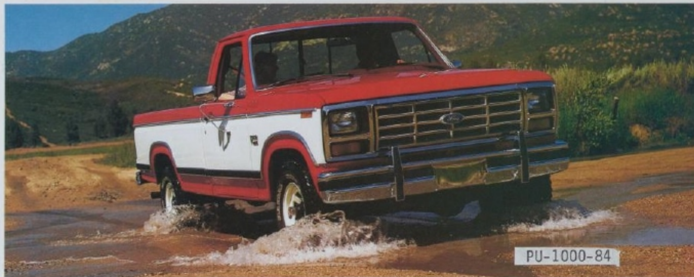
Ford F-Series. Some equipment shown may be optional.