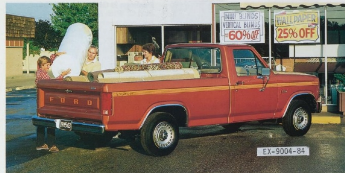
F-Series Explorer Package A. Some non-Explorer options may be shown.