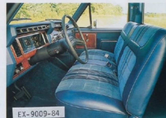
F-Series Explorer Package B. Some non-Explorer options may be shown.

*Savings based on manufacturer's suggested retail price for the package compared with traditional pricing for the options purchased separately.