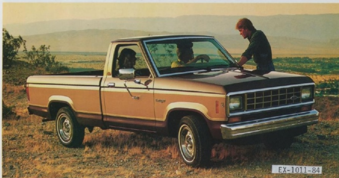
Ranger Explorer Package D includes Deluxe Tu-Tone. Some non-Explorer options may be shown.

**Standard on 4x4 and with optional payload packages on 4x2 models.