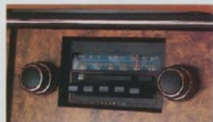
AM/FM Monaural Radio EX-1015-84