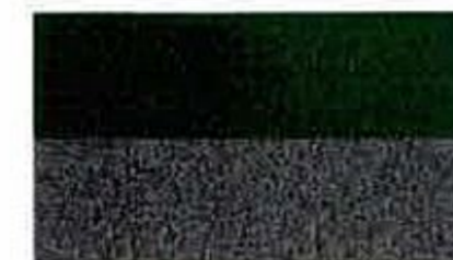
Tropic Green Clearcoat Metallic/ Medium Platinum