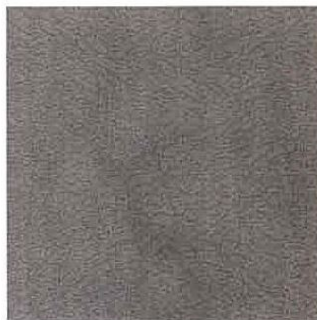
LEATHER Medium Graphite also available in Dark Graphite and Prairie Tan