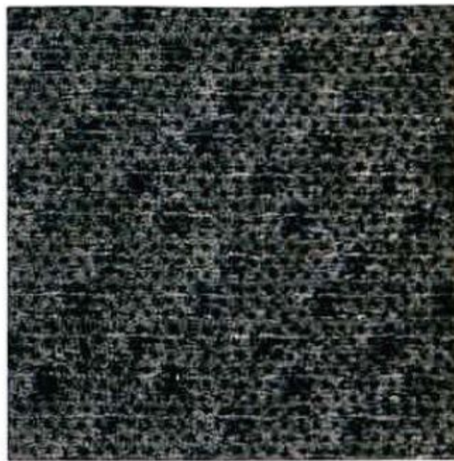
CLOTH Dark Graphite also available in Medium Graphite and Prairie Tan