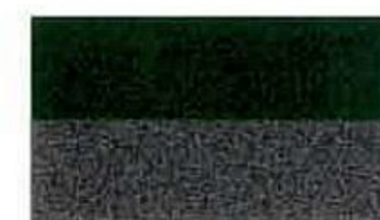
Tropic Green Clearcoat Metallic/ Medium Platinum