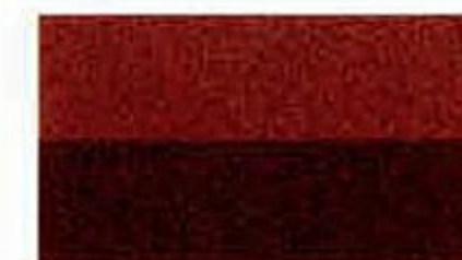
Toreador Red Clearcoat Metallic/ Dark Toreador Red Clearcoat Metallic