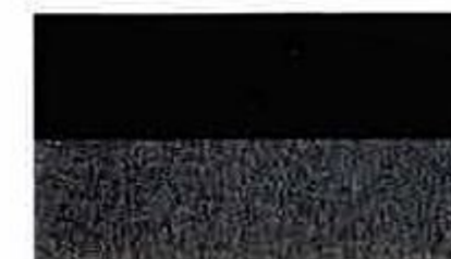
Black Clearcoat/ Medium Platinum