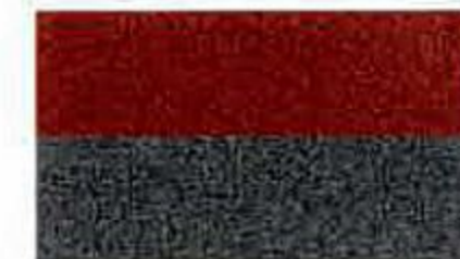
Toreador Red Clearcoat Metallic/ Medium Platinum