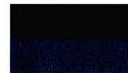
Deep Wedgewood Blue Clearcoat Metallic/ Medium Wedgewood Blue Clearcoat Metallic