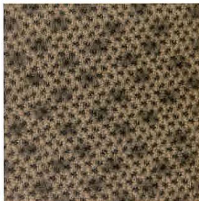
CLOTH Prairie Tan (shown)