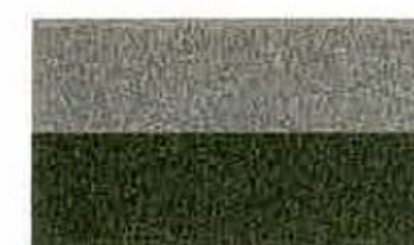
Spruce Green Clearcoat Metallic/ Estate Green Clearcoat Metallic