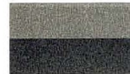
Spruce Green Clearcoat Metallic/ Medium Platinum