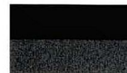
Black Clearcoat/ Medium Platinum