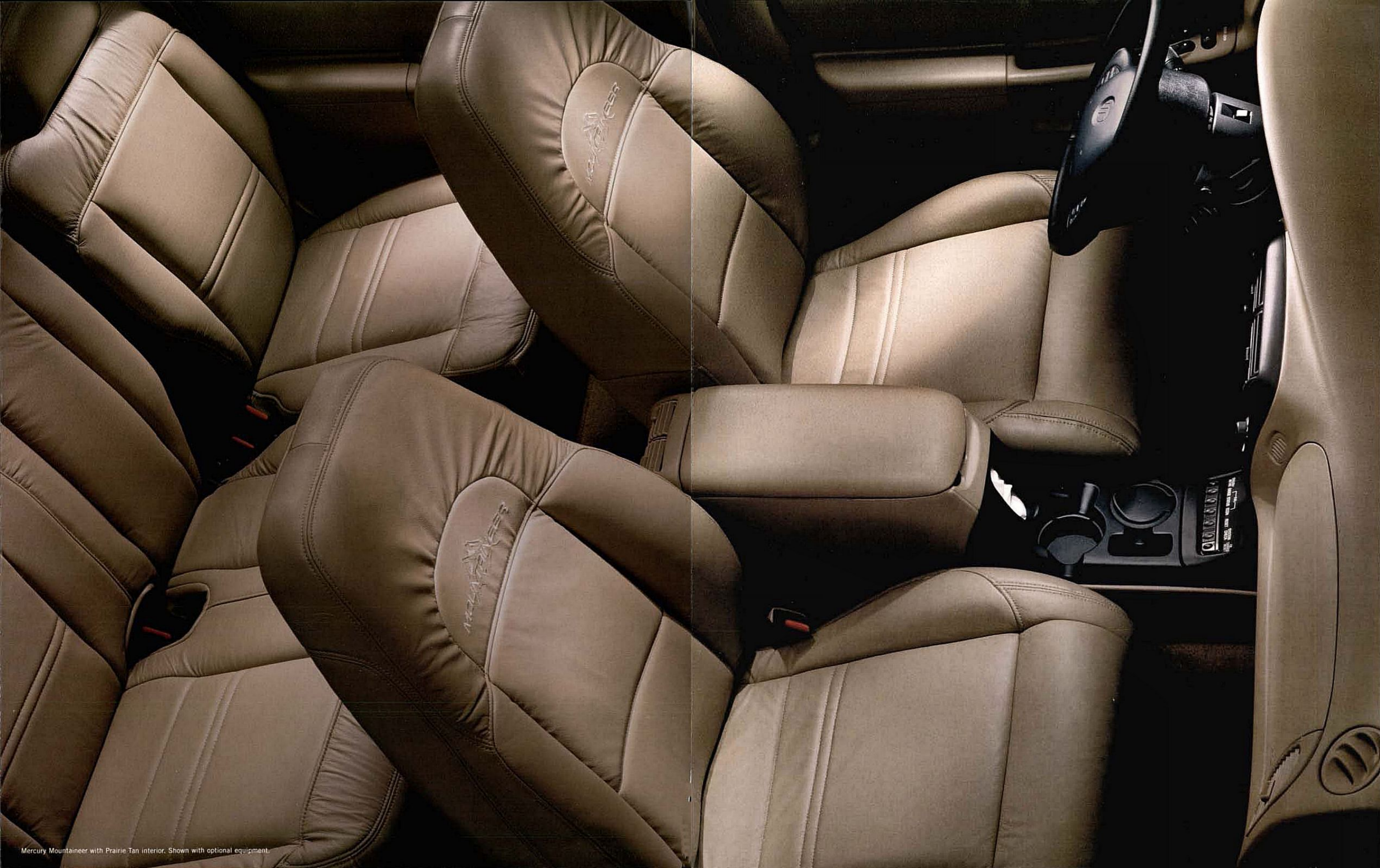
Mercury Mountaineer with Prairie Tan interior. Shown with optional equipment.