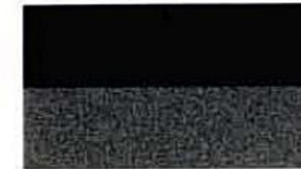
Deep Wedgewood Blue Clearcoat Metallic/Medium Platinum