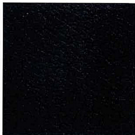
LEATHER Midnight Blue also available in Greystone and Prairie Tan