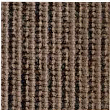
LS CLOTH Prairie Tan also available in Greystone and Midnight Blue