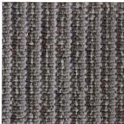
GS CLOTH Greystone also available in Midnight Blue and Prairie Tan