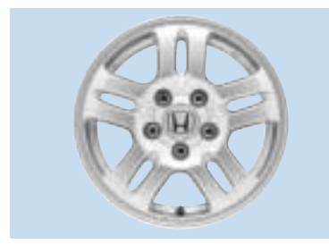
15" Split 5 Spoke Alloy