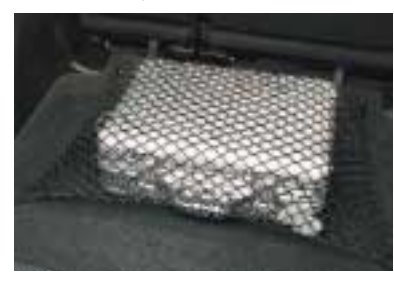
Boot Tie Down Net