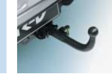
Detachable trailer hitch with electrics