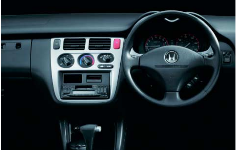
How do you create an interior for the HR-V - as innovative and daring as the outside, yet usable and easy to live with?

You'll find plenty of creativity in here - that 'dual-cowl' dashboard, and the restrained use of metallic finishes, for instance - but there's common-sense too. Everything looks right because it works right, and is the result of hours of thought and effort. We've put a lot of ourselves into this car, and now it's yours. Enjoy.