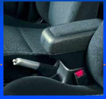
Front Centre Armrest and Console Box Great for storage and de-away items. With grey