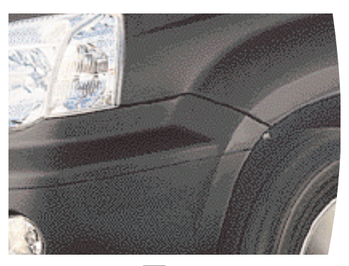
Kuro Black S