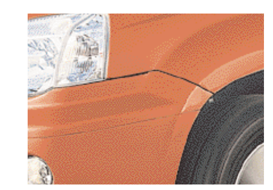
Chilli Pepper S