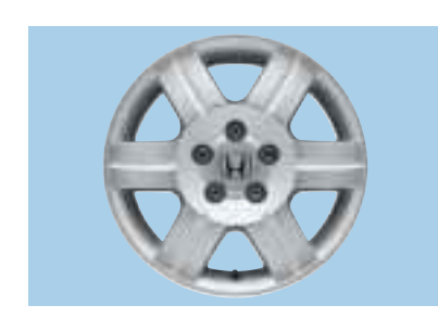
16" 6 Spoke Alloy