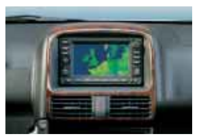
DVD Satellite Navigation CD Tuner and wood interior panel kit