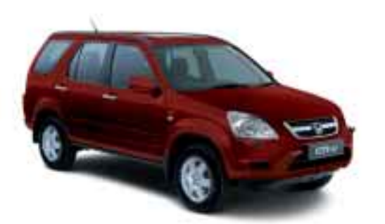
Volcano Red Pearl**