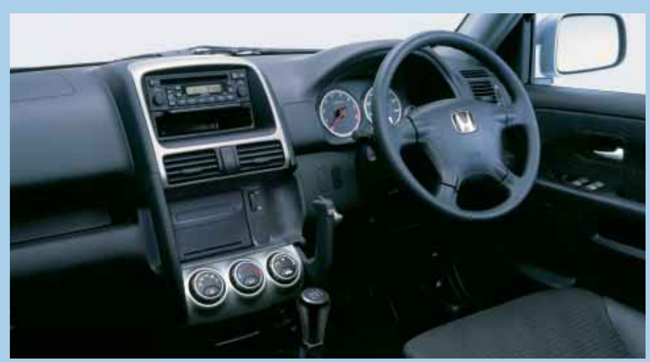
Available with all colour options. For full exterior colour options please see colour palette at back of brochure.