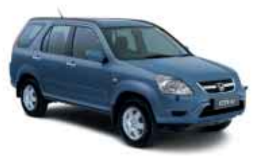
Magnetic Blue Metallic