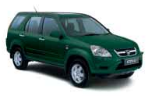
Clover Green Pearl**