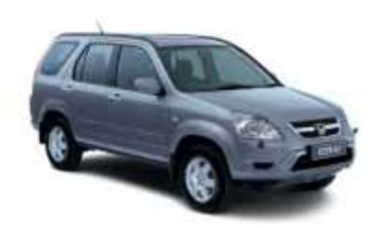
Cosmic Grey Pearl**