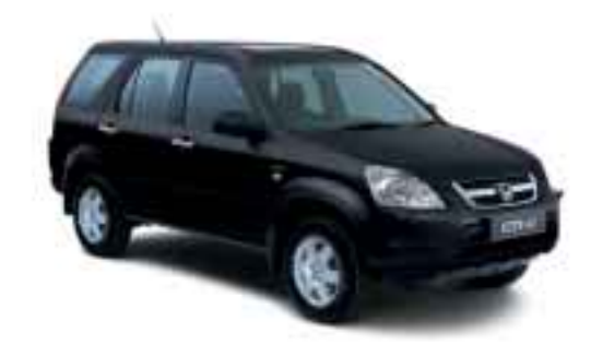
Nighthawk Black Pearl**