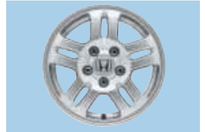
15" Split 5 Spoke Alloy