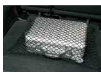
Boot Tie Down Net