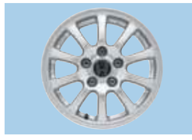
15" 10 Spoke Alloy