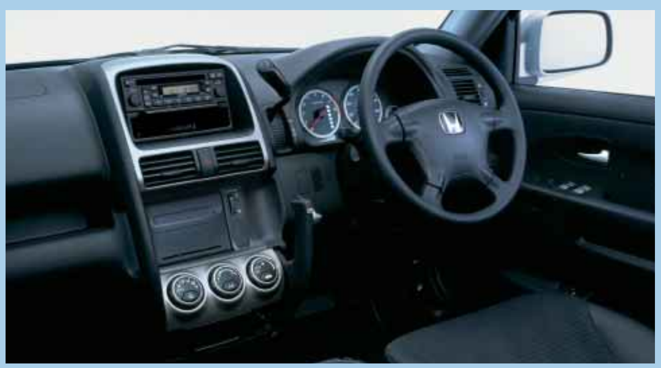
Model shown is SE Sport automatic

Available with all colour options. For full exterior colour options please see colour palette at back of brochure.