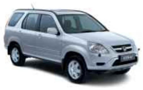
Satin Silver Metallic

**Titanium perforated leather upholstery on Executive grade available with this exterior colour