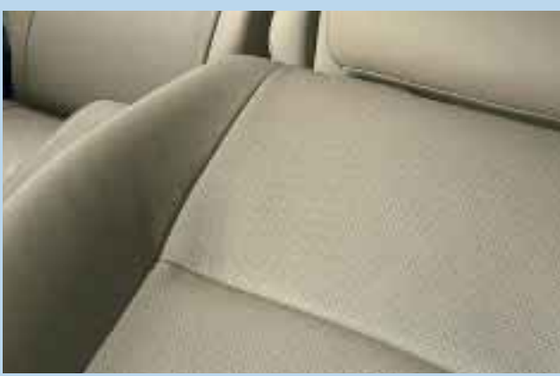
Available with Nighthawk Black Pearl, Eternal Blue Pearl, Clover Green Pearl, Volcano Red Pearl, and Cosmic Grey Pearl colour options.

For full exterior colour options please see colour palette at back of brochure.