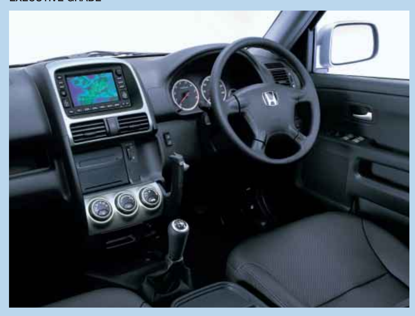
Executive interior with black perforated leather upholstery.