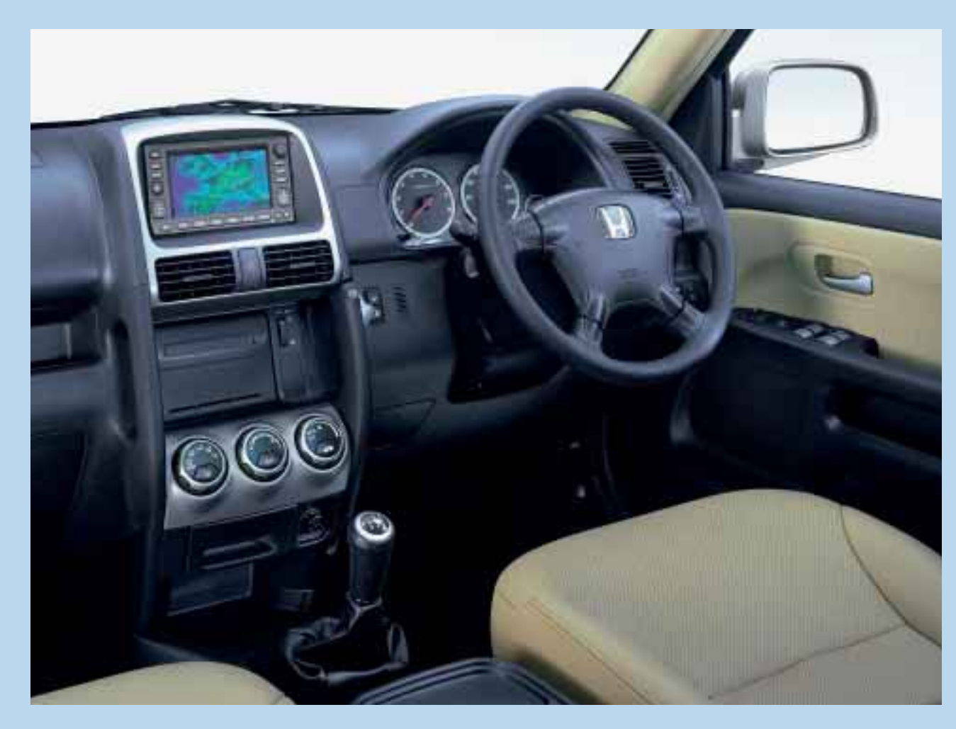
Executive interior with optional titanium perforated leather upholstery.

For full exterior colour options please see colour palette at back of brochure.