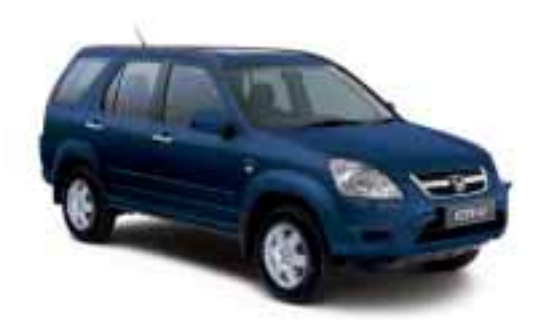
Eternal Blue Pearl**