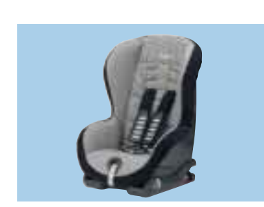
ISOFix childseat (9-18 kg)