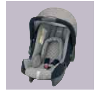
Child seat 'Babysafe' For children from 0-15 months old (Universal).

For a full list of Genuine Honda accessories please refer to the price list or your local Honda dealer.