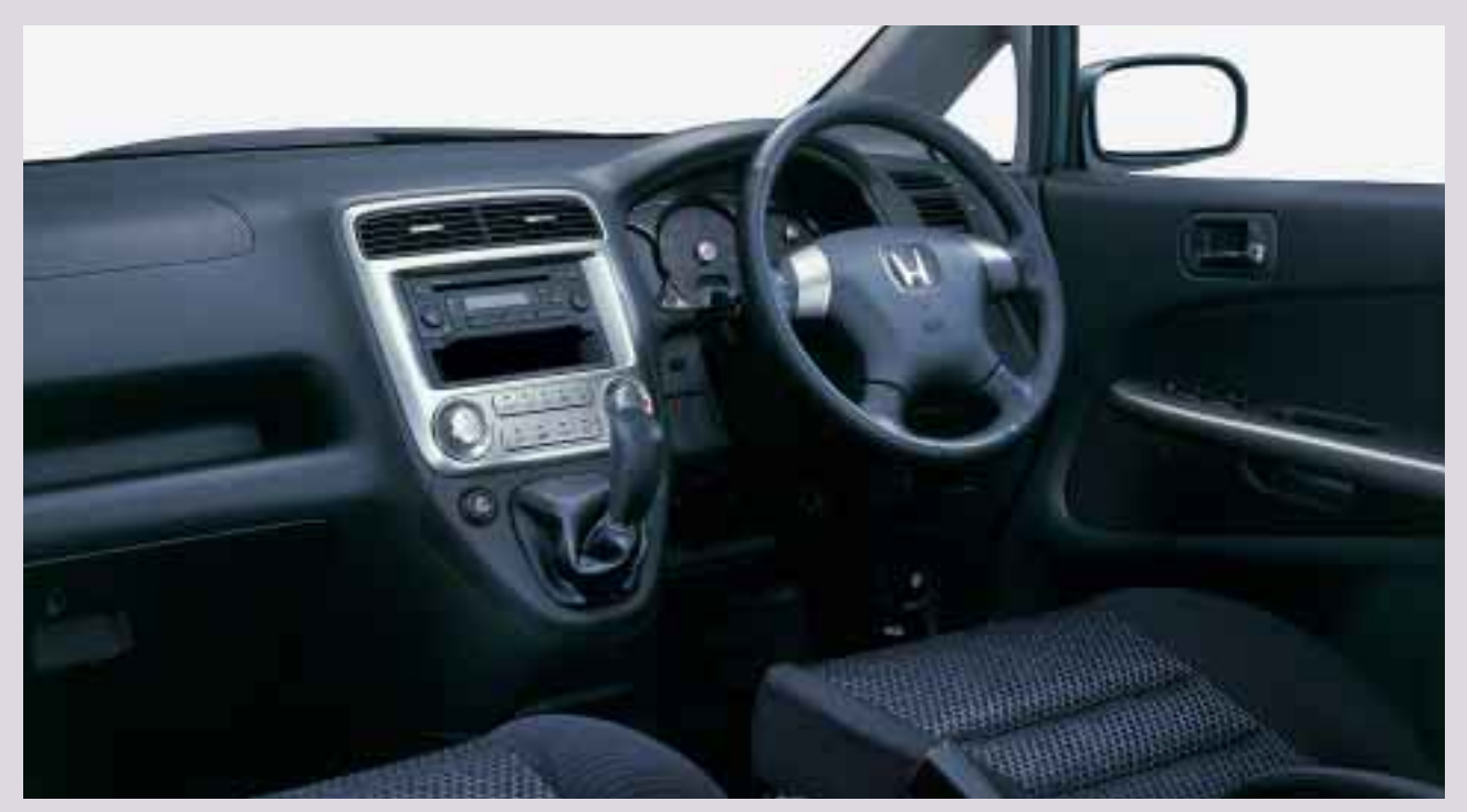
For colour options please see colour palette at back of brochure.