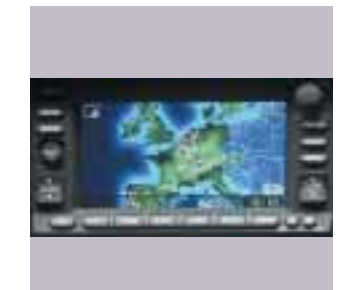
DVD Satellite Navigation CD tuner Find your way around easily with the whole of Europe on one disc.