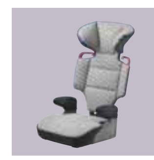
Booster and back rest For children from 3 years to 12 years (15 to 36 kg).