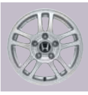
15" 5 Split Spoke Alloy Wheel