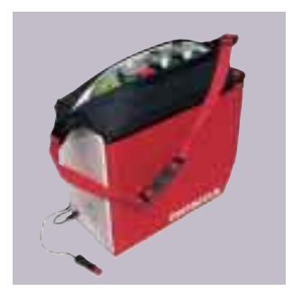
Cooling Box Fridge Cooler box plugs into cigarette lighter socket. Chills to 4°C fridge temperature. Mains adapter also available.