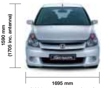
(1924 mm inc. door mirrors)