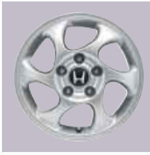
15" 6 Spoke Alloy Wheel