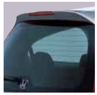
Rear Spoiler Sporting looks with a rear brake light helps reduce rear screen dirt accumulation.