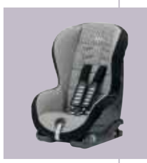
Child seat 'Duo' For children from 8 months to 4 years (9 to 18 kg) (ISOFix).