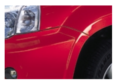
Chilli Pepper AX6