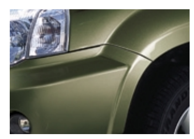
Verdale Green D13