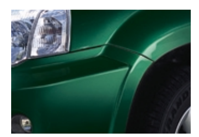
Amazon Green DW0 MP