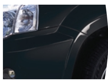
Kuro Black KH3