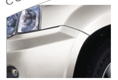
Blade Silver KY0