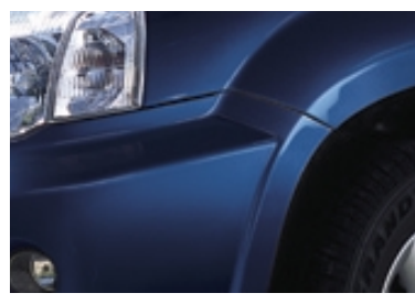
Aruba Blue BW6 MP