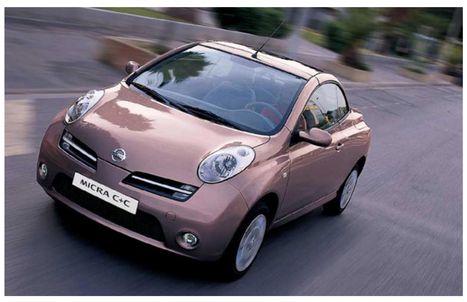
Created on 12 February 2006 04:05 (UK time)