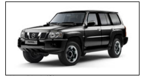
Kuro Black (S)