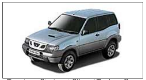
Two-tone Starburst Silver / Techno Grey