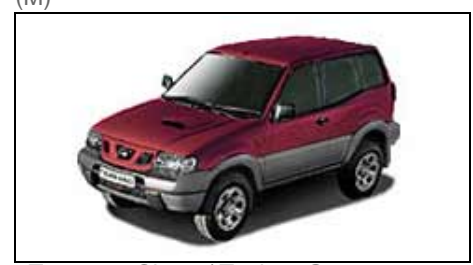
Two-tone Claret / Techno Grey