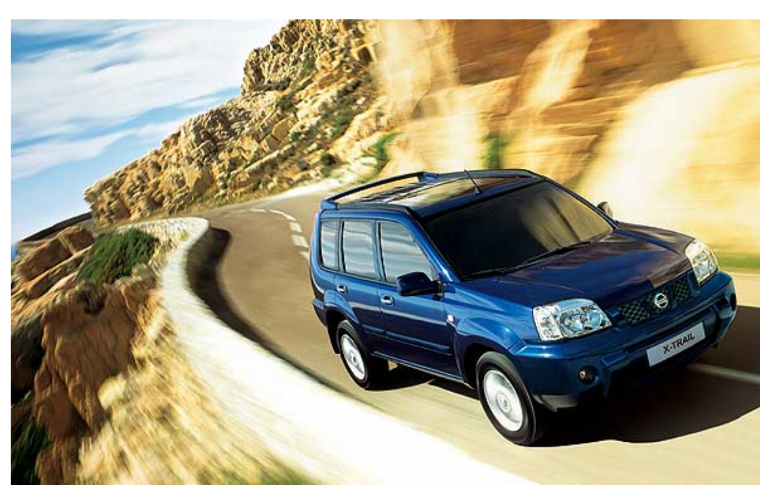
Created on 04 February 2006 05:10