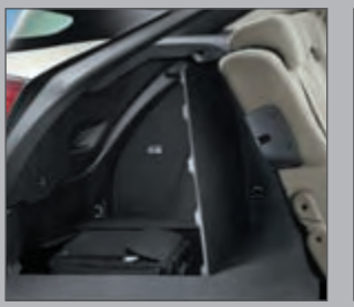
54 > Cargo Floor Lid