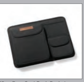
55 > Rear Seat Back Pocket