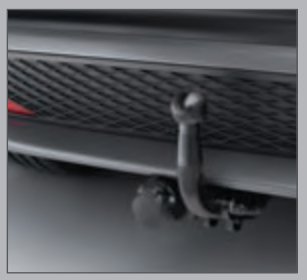
47 > Fixed Trailer Hitch