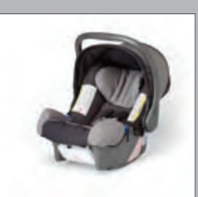
34 > Child Seat Group 0+ (Universal Seat Belt fitment)