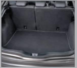
52 > Trunk Mat