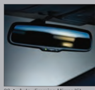
28 > Auto-dimming Mirror Kit

iPod is a trademark of Apple Computer, Inc., registered in the U.S. and other countries.