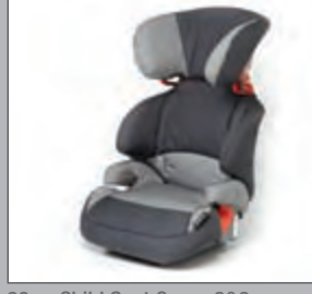
38 > Child Seat Group 2&3 (Universal Seat Belt fitment)