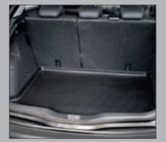
53 > Trunk Tray