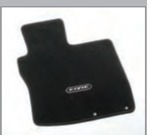
30 > Elegance Floor Carpets