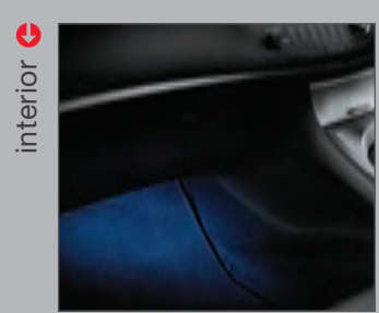
29 > Blue Ambient Footwell Lighting