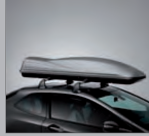
43 > Ski Box 320 L