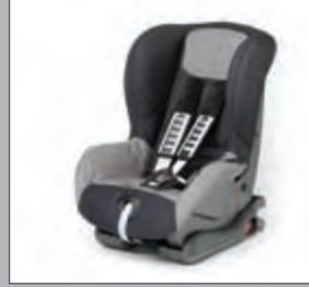
37 > Child Seat Group 1+ (ISOFix)