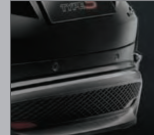
10 > Rear Parking Sensors