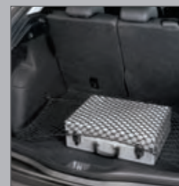
51 > Tie Down Net