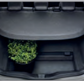
56 > Rear Shelf