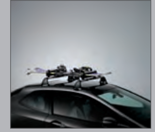
40 > Front Clamps for Roof Rack 41 > Ski & Snowboard Attachment 42 > Top Box 350 L