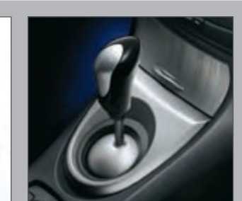
32 > Gearshift Knob - 6MT