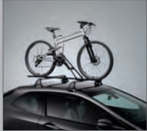
44 > Bicycle Attachment Classic 45 > Bicycle Attachment Easy-fit 46 > Bicycle Lift