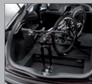
49 > Interior Bicycle Attachment 50 > Tie Down Belt