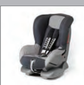
36 > Child Seat Group 1+ (Universal Seat Belt fitment)