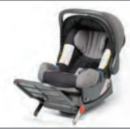
35 > Child Seat Group 0+ (ISOFix)