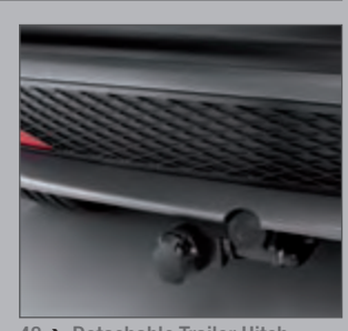
48 > Detachable Trailer Hitch (detached)