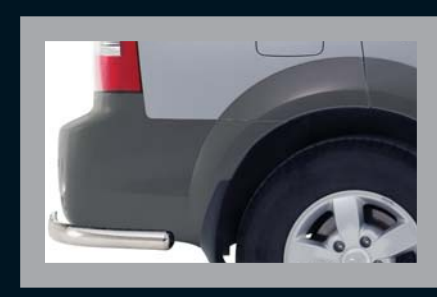
Rear Quarter Chrome Style Bars