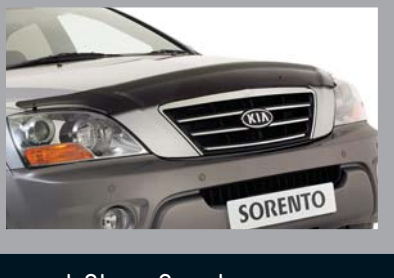
Bonnnet Stone Guard