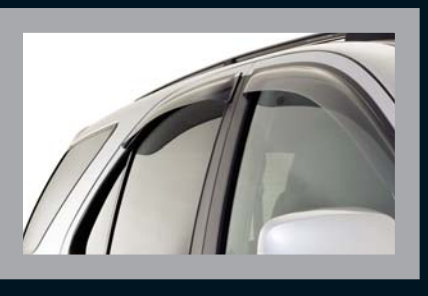
Side Window Deflector

We have a wide selection of accessories available to make your Sorento even more individual - and useful. See our website for full details.