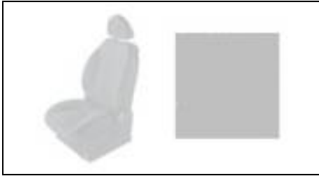
Ice Blue and Chocolate