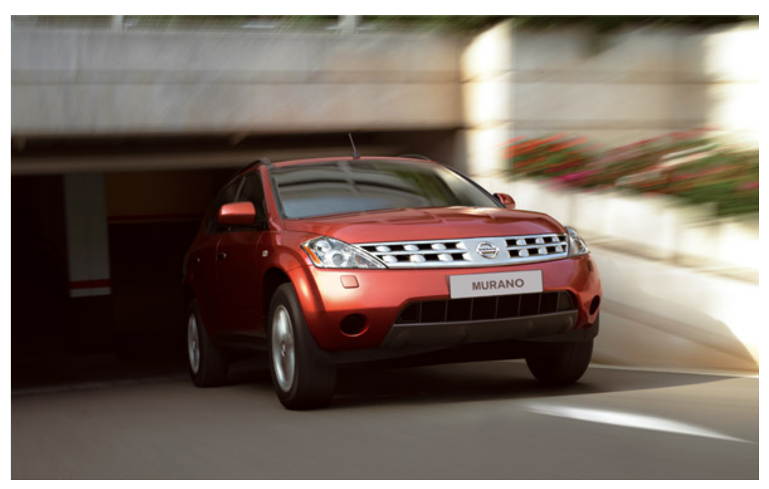
Created on 16 March 2007 05:02 (UK time)