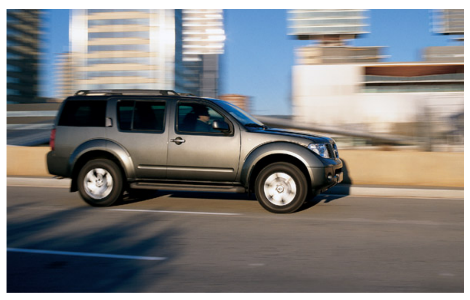
Created on 14 March 2007 05:02 (UK time)