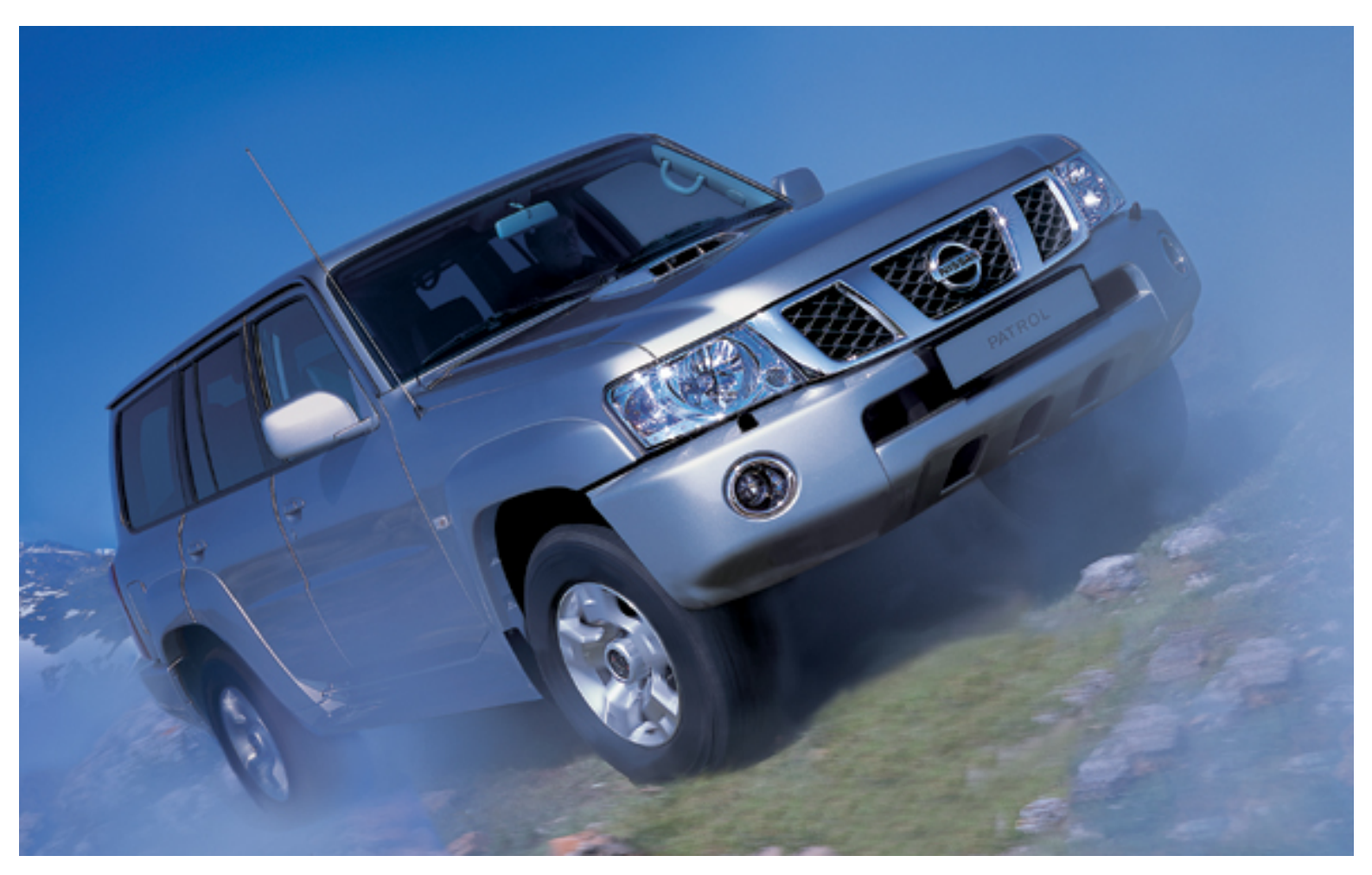
Created on 25 February 2007 05:11 (UK time)